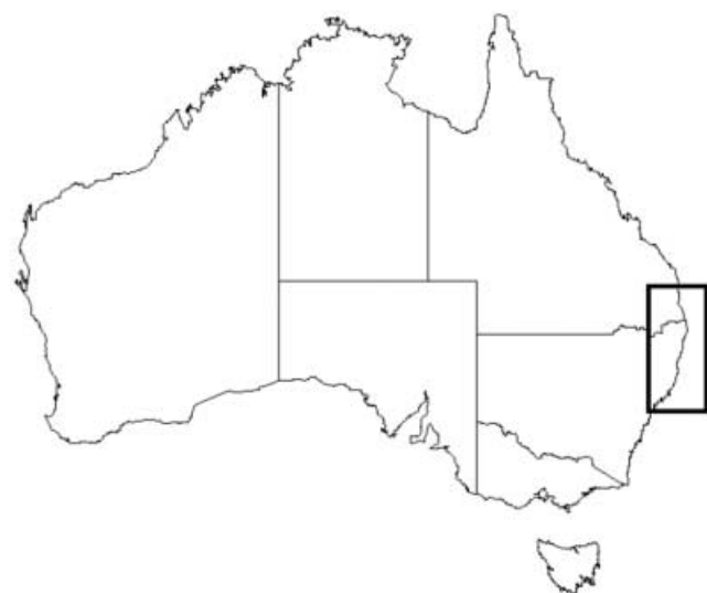
Figure 1. Map of Australia, with a box showing the study area.

by being stored in six programmable depth ranges (histogram bins). Bins were incremented over a 6-h period. Bin ranges for each animal are shown in Table 1. As Animal 1's maximum dive depth data indicated almost no dives over 50 m, Animal 2's maximum dive depth data bins were set differently. Other bin ranges were kept constant for comparison with Animal 1. Tags were scheduled to transmit eight hours in every 24.