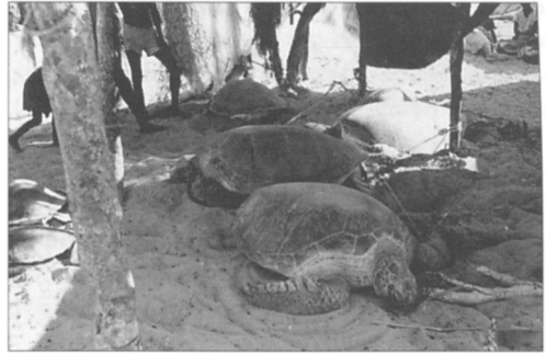
Adult green turtles awaiting sale at Beravina, north of Toliara (A. Cooke).

Captures by hunting teams can be impressive – on one occasion we saw hunters from the village of Beravina, north of Toliara, net 12 adult green turtles each 1 m or more in length (five male, seven female) in a single night. Table 1 gives capture rates claimed by occupa-