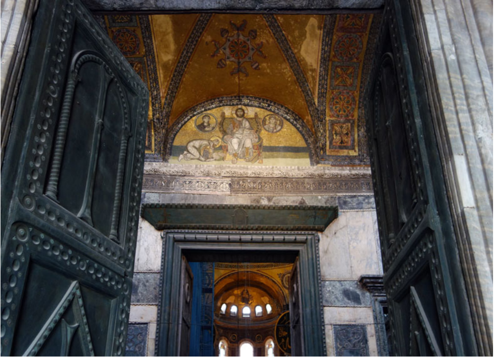
Figure 2 Hagia Sophia, Constantinople. A view of the royal proskynesis -mosaic

articulation of an eloquent visual comment on current public issues in the Byzantine capital.