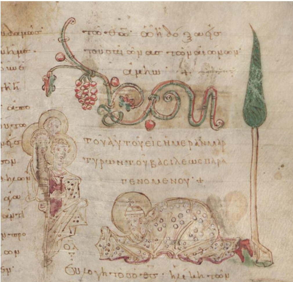
Figure 1 EBE 211, fol. 63r. An anonymous emperor prostrating at the feet of three anonymous martyrs

end of Iconoclasm in varied ritual and devotional performances, is no easy task. Gestures and postures mattered, and their charged choreography did not necessarily assign a single meaning to a particular move. So, context is pivotal in the process of unravelling the transformation of the elusive posture of proskynesis from the pragmatic into the symbolic.