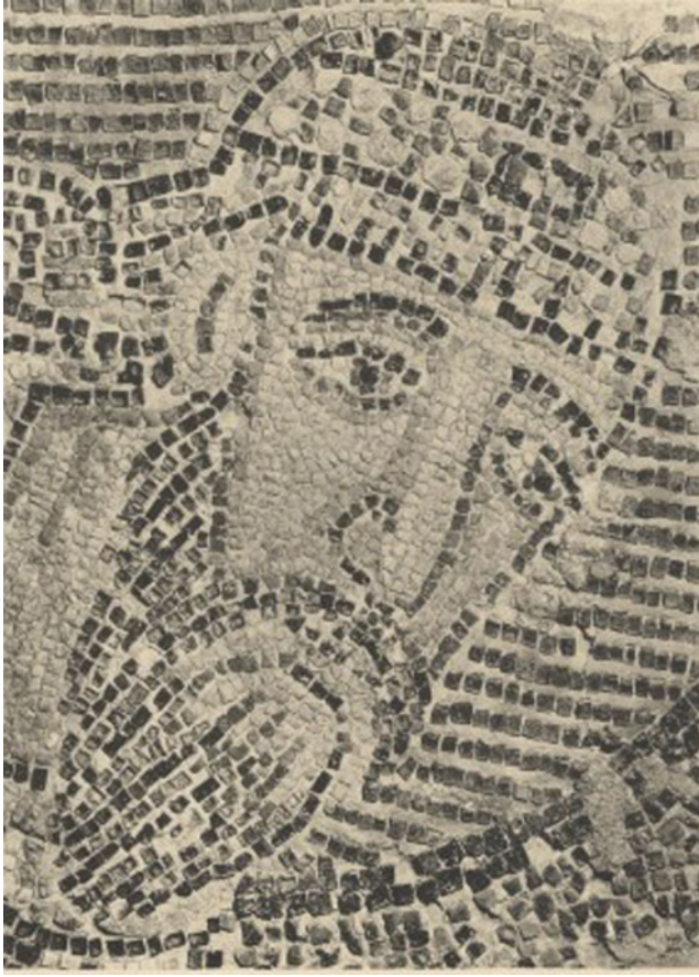
Figure 6 Detail of the emperor in the proskynesis -mosaic (reproduced from T. Whittemore, The Mosaics of St. Sophia at Istanbul. Preliminary report on the first year's work, 1931–32. The mosaics of the narthex [Oxford 1933], Pl. XXI – on public domain @ https://doi.org/10.11588/digit.55204 )

aftertaste of mortality and an odour of death. Perhaps for this very reason, the laconic composition illustrating this sermon and mediating visually the entreaty of the king is meaningfully framed by the lofty cypress tree: it points elegantly upwards, towards the heavenly kingdom that both the ‘wise philosopher’ of the sermon and the kneeling emperor of the image anticipate vehemently.