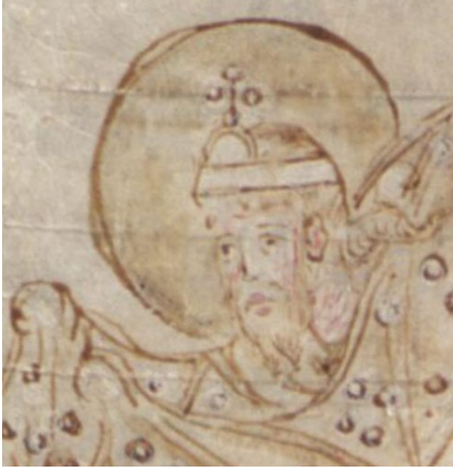
Figure 5 Detail of the imperial figure in EBE 211, fol. 63r

Drypia, which was delivered in the presence of the empress and sounded more like a panegyric, 38 the second one contained in the Athenian codex is rather introverted and loaded with soteriological overtones. Right from the beginning the emperor and his military escort are praised for their humility. By escaping the vainglory of worldly power, pride and ostentation, they will reap their reward in heaven through the intercession of the martyrs. Death, unknown to God's creatures before the fall, was taught to Adam and Eve by the Creator Himself through the fratricide. The heroes of the Old Testament such as Enoch, Noah, Jonah, and Elijah, prefigured through their example salvation from death and thus offer comfort and hope to the believer. The sermon ends with an interesting address to the 'philosopher and the sublime one', 39 for whom the hierarch's admonitions are unnecessary, since he already knows the magnitude of the heavenly kingdom and realizes the vanity of earthly pleasures and temptations. 40 Undoubtedly, the spirit of the homily leaves an