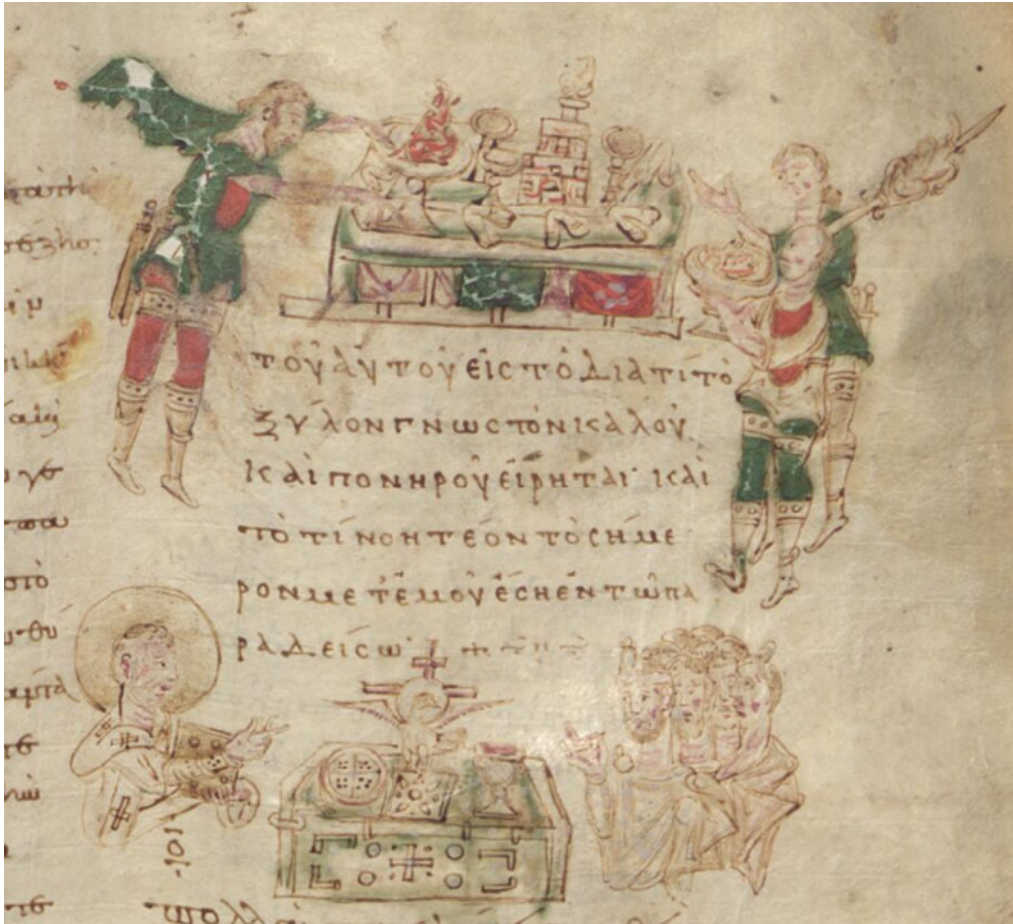
Figure 3 EBE 211, 56r. Two parallel banquets

Another indicative case of a royal model that stands out in stark contrast to the virtuous emperor will further underscore the talent of the miniaturist and his ability to adjust the imperial formula meaningfully within varied visual contexts. On folio 132v (Fig. 4) at the opening of the sermon dedicated to the moral value of repentance, 36 Herod and John the Baptist, the devious king is represented seated on a throne as he witnesses the abominable outcome of John's beheading. Directly across Herod the parchment has been excised, and, judging by the outline of the hole, we may safely assume that there it must have appeared the head of the Baptist on a disc. It might have been Salome presenting it to the king, or even Herodias herself. Herod embodies an anti-hero, the stereotype of the immoral and decadent