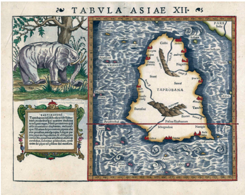
Figure 5.2 Tabula Asiae XII ; hand-coloured map by Sebastian Münster, c.1552. From Ptolemy's Geographia universalis , 1540 ed., rev. & ed. by Sebastian Münster. Sri Lanka is labelled 'Taprobana' on the map, a name which was given to Sumatra on maps in later editions of the Geographia . MIT.

elephant's angry eyes and serpentine trunk immediately attract the reader's attention. The way in which this elephant is depicted is in keeping with earlier European mapping traditions which sometimes represent elephants as looking like wild boars with trumpet-like trunks. 21 Ludovico di Varthema, who visited Lanka, is then cited. The island, we are told, 'exports elephants that are larger and nobler than those found elsewhere'. 22 Taprobane becomes known here for its anomalous natural history; its unusual elephants make a stand on the map. The description from Varthema continues: 'Its yield of the long pepper is likewise richer, indeed wonderful in its abundance.' 23 Soon the map was edited once again, and the elephant was made less fierce (Figure 5.3). Even while tracing the reverberations of Ptolemy's 'Taprobane' like this, one important caveat is that the idea, together with the knowledge of sailors and merchants