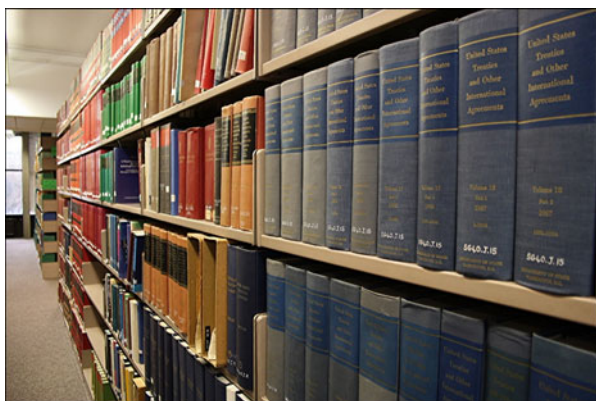
Figure 2. Part of the public international law collection, with the US treaty series in the foreground.

Every year IALS Library buys a substantial number of books on international law, and we have classic treatises on the subject going back centuries. We subscribe to journals and yearbooks of international law from all over the world: there approximately 140 series on the open shelves and more in the basement depository and online. Leading international law journals include American Journal of International Law , International and Comparative Law Quarterly , Journal de droit international (known as