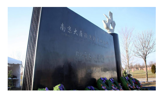
Image 2. Nanjing Massacre Victims Monument at Elgin Mills Cemetery in Richmond Hill, Ontario during its 2018 unveiling.

"anti-racism; education; heritage; monument; community and culture; and especially seniors' health and wellness" (BC Redress 2022b).