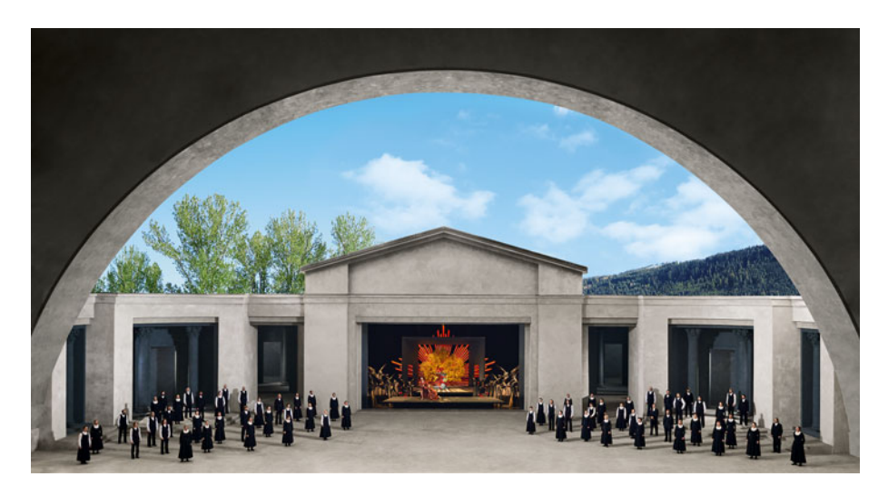
FIG. 4 The Oberammergau choir, costumed in the 2022 production as the seventeenth-century Bavarians who initiated the Passion Play tradition, sing without a central narrator, who used to be called the Prologue. At the centre of this image is a tableau of the Garden of Eden – one of many tableaux depicting Hebrew Bible narratives interspersed throughout the Passion Play.