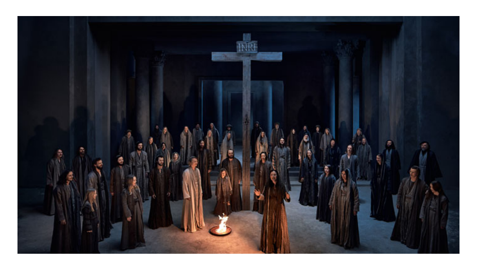
Fig. 5 The 2022 Oberammergau Passion Play stages the Resurrection without a resurrected Jesus physically present. Mary Magdalene, pictured downstage centre, looks out over the audience and declares that Jesus has returned. Near her stands an angel, who has brought on a giant flame, and around them stand the choir. The choir, here representing a subset of the larger community, ultimately take out candles and light them from the giant flame, before exiting.

friend, as a gesture of forgiveness and acceptance. He tried it out in rehearsal, spontaneously, and then kept it, with the approval of the director.<sup>52</sup> Another performer told me that the actors, in small groups, were constantly initiating smaller, subtler adjustments, on their own initiative, as they discussed problems and attempted to solve them. So, for example, at one of the final rehearsals, the group of actors playing apostles got together with the group of Temple Guard soldiers to discuss and rework the sequence of events at Jesus' arrest. 53 He said that he does not think they initiated changes on their own quite so much in past iterations, but that now, there is such an embrace of experimentation as a way of working that they do so organically.