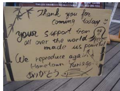
Lower right: Thank you message.