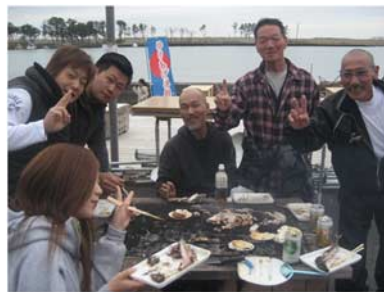
Lower left: "Peace" friends at the local market.