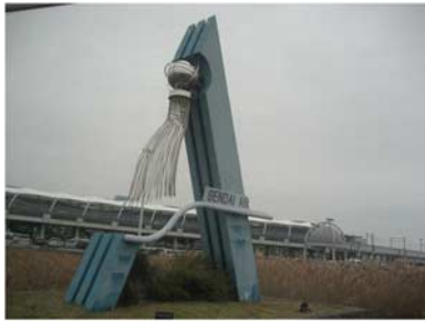
Upper left: Sendai airport entrance.