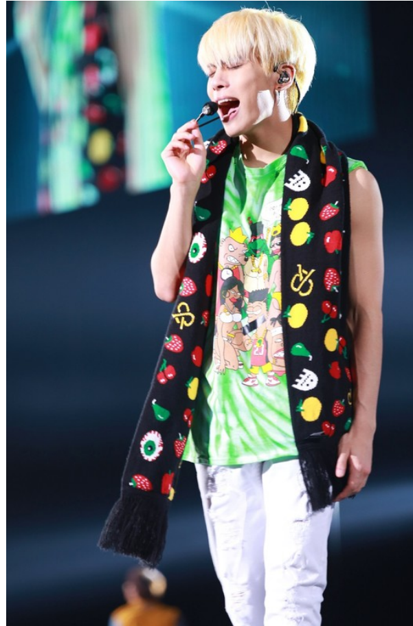
Jonghyun singing in Taiwan, May 11 th , 2014 (SHINee World Concert III).