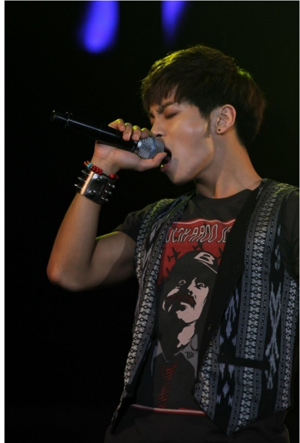
Jonghyun performs at the EXPO Arirang Pop Music Festival, July 27 th , 2012.

"Deja-bu," a solo song by Jonghyun featuring a guest appearance by Zion-T "She Is" was Jonghyun's 2016 solo hit