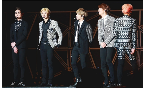
SHINee in performance in Taiwan, March 21 st , 2015 (SM Town Live World Tour IV). (l-r: Onew, Taemin, Jonghyun, Minho, Key).