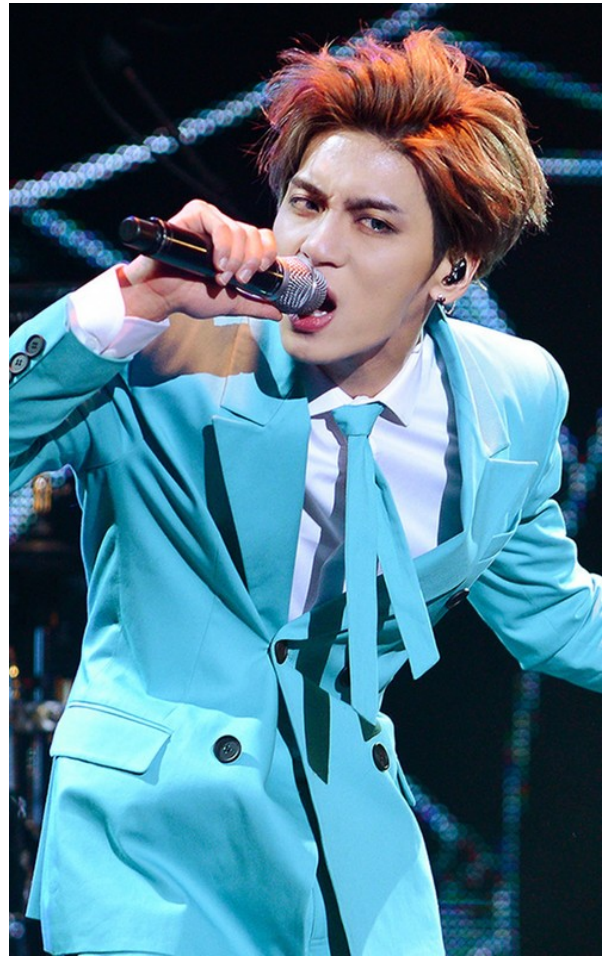
Jonghyun performing during the January 8 th , 2015 Base Showcase.

In K-pop, Bieber-esque misdeeds would virtually destroy an artist's career. 54 In the Korean media, idols' behavior can spark controversies and discussions around their "bad" attitude, which they might be accused of if, for example, they did not seem sufficiently sincere when greeting others, especially "senior" celebrities, on television programs. 55 Has an American star ever been castigated in headlines for failing to enthusiastically say hello to another star? Control over stars in this way is made possible precisely by the fact that the Korean spectators are considerably more homogenous than, for example, the North American media consumer, and generally share ideas of performed politeness. Furthermore, in Korea, there is significant inter-generational media consumption—a popular drama may achieve a 20% viewership rate—and K-pop is similarly viewed and listened to by young and old alike (albeit more passively by older generations). Outside Korea, the viewers and producers of a show like Duck Dynasty may have little overlap with the American who objects to Kendall Jenner's Pepsi ad or Roseanne Barr's tweets. Those celebrities can do things that cause vocal protests, but maintain a core fan base and find future work. However, the smaller and more tight-knit nature of the Korean media business means that once consensus turns against a star, it can be very hard to find someone willing to offer them a second chance.