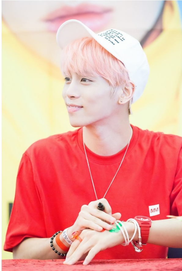
Jonghyun at a fan event in Busan, June 2016.