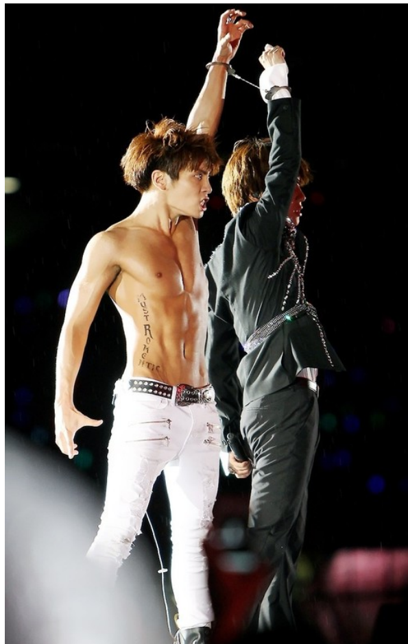
Jonghyun and Taemin performing, August 18 th , 2012 in Seoul (SM Town Live World Tour III).

do bow out of fame, choosing to escape from an industry that seems poised to destroy them. For example, 2NE1's Park Bom, B2ST's Jang Hyeonseung and AOA's ChoA have all retreated from the public eye. A few successfully re-enter the ranks of idol stars, like Sunmi who left the Wonder Girls to attend university in 2010, re-entered the group in 2015, and had a highly successful solo debut in 2017.