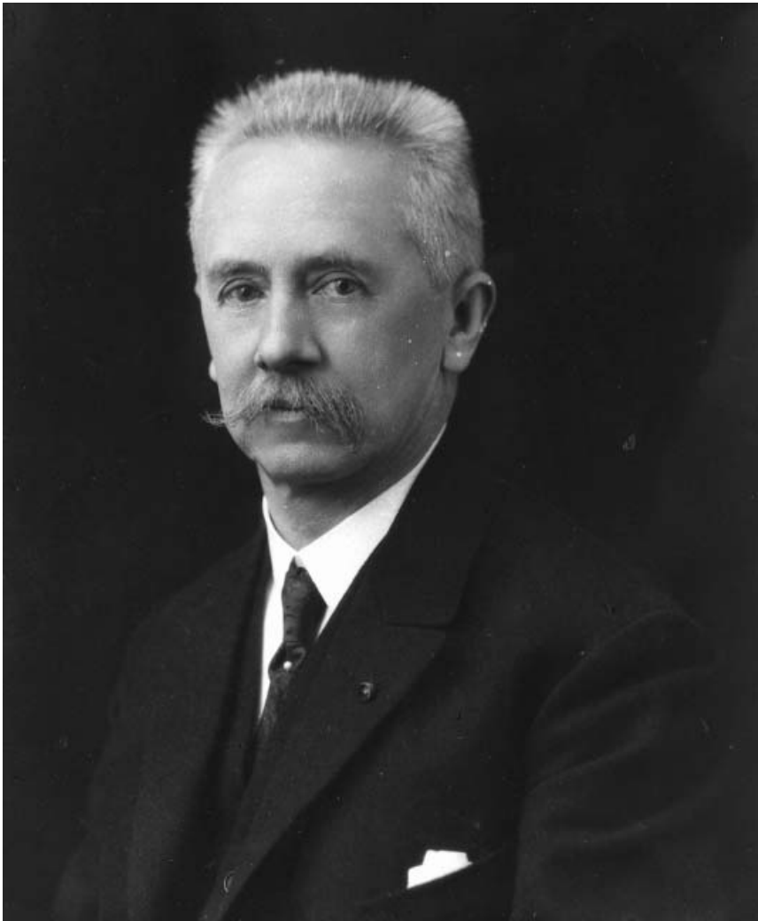
Figure 3. Ernest Mahaim (1865–1938), Belgian government representative to the International Labour Conference 1919–1938, President of the 14th International Labour Conference 1930, and Chairman of the Governing Body 1931–1932.