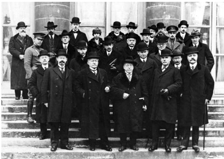
Figure 2. The Commission on International Labour Legislation, Paris, 1919, with Emile Vandervelde (front row, extreme left), Ernest Mahaim (second row, extreme left), and Samuel Gompers (front row, centre).