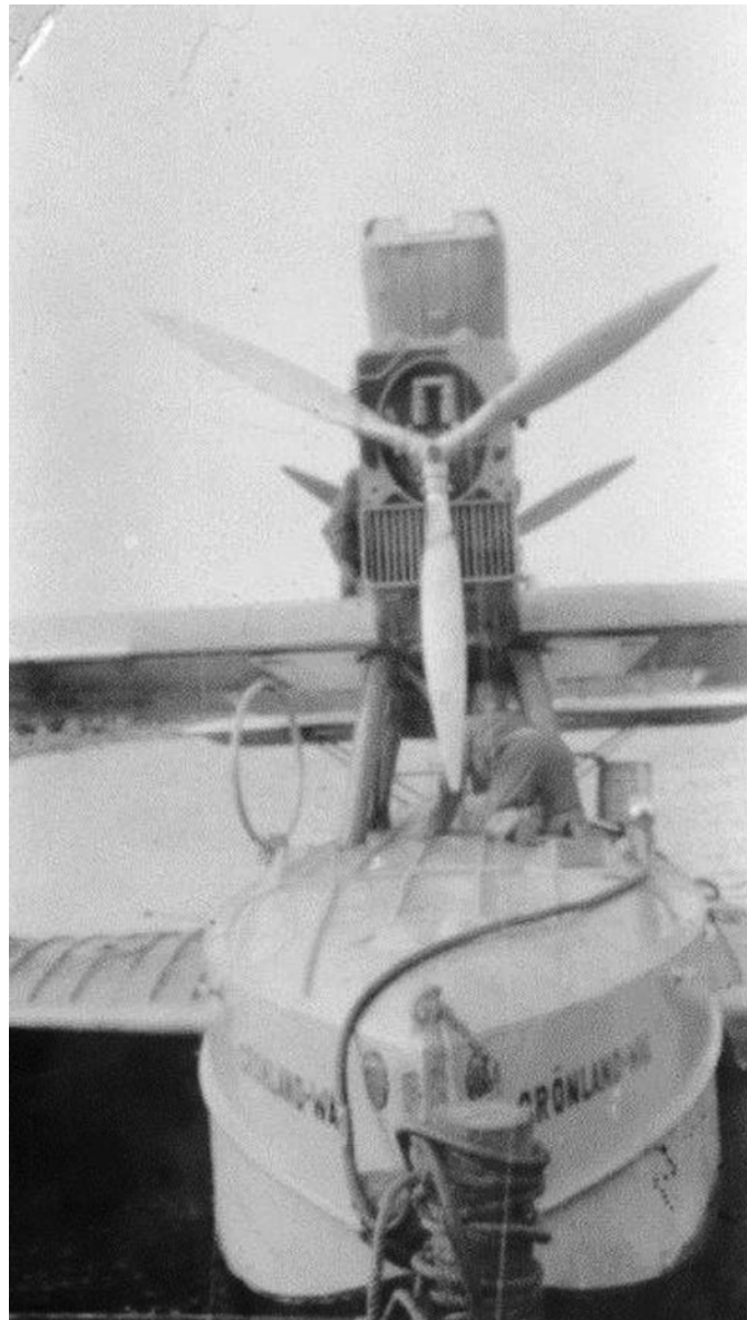
Fig. 3. The flying boat at the wharf in Port Harrison being refueled.