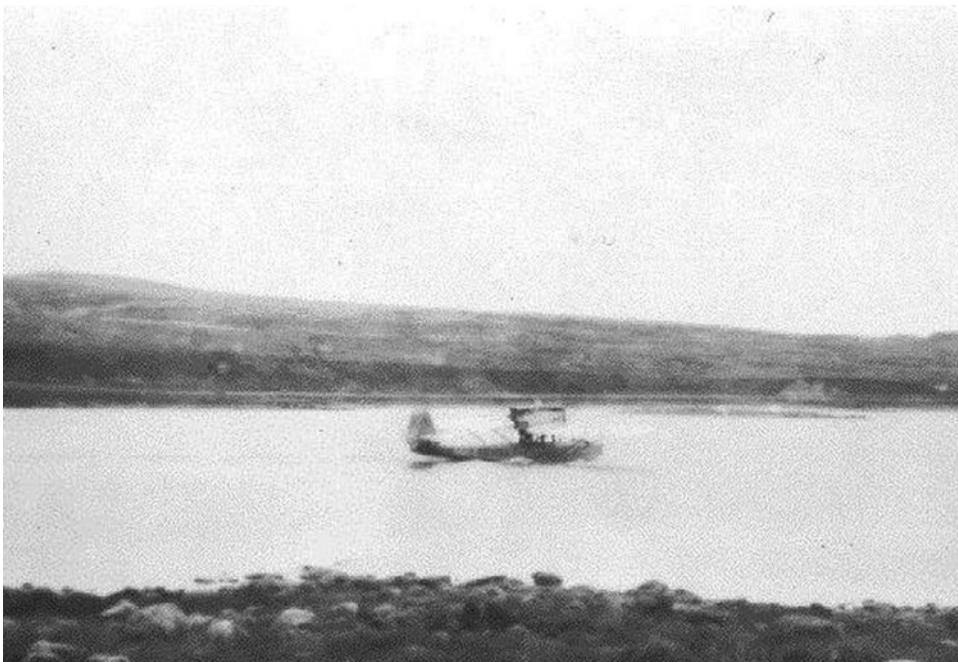
Fig. 5. The flying boat taking off.