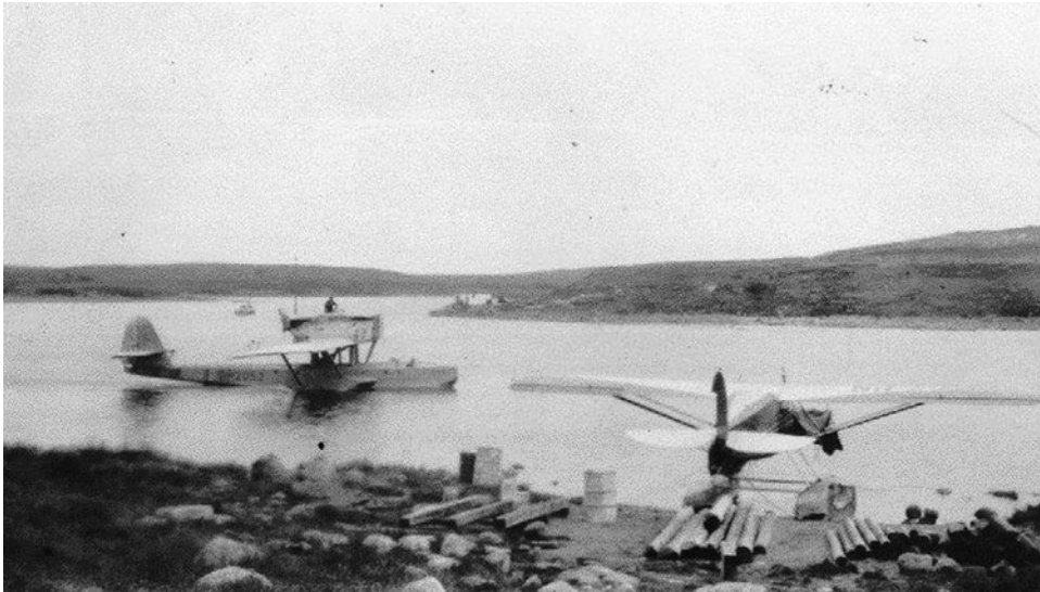
Fig. 4. 31 August 1931 the flying boat preparing for take-off en route to Chicago.