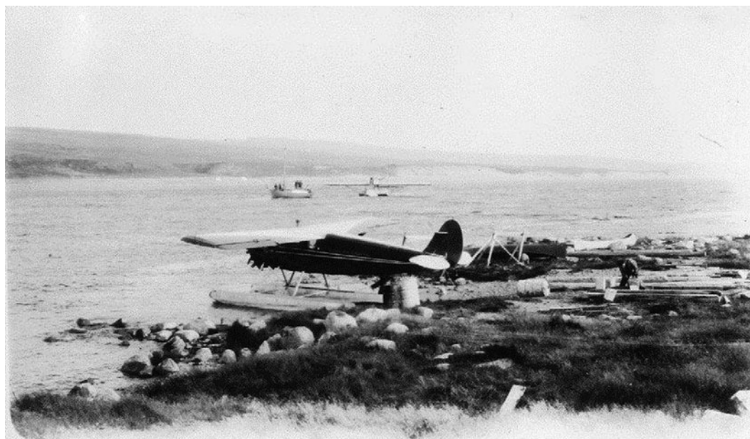
Fig. 1. The Dornier Wal 2053 flying boat landing on the Innuksuak River and approaching Port Harrison (Inukjuak).

Wegener, K. 1932. Commander von Gronau's flight over Greenland, 1931. Polar Record 1(4): 52–55.