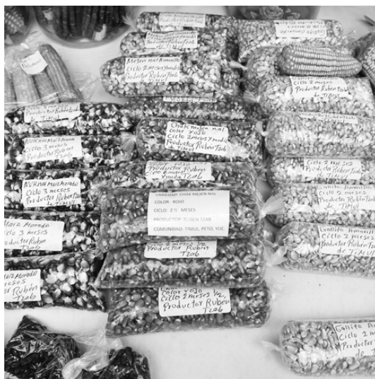
Figure 11.6 Maize seeds from a farmers' seed fair in Mérida, Mexico, 2014.

seeds and agrobiodiversity.” 91 Even though these principles are hardly fully translated into national agricultural policies, their declaration signals the important institutional changes driven in part by a shifting balance of power between different epistemic cultures in crop conservation and use alongside hard-fought political struggles. Many contemporary understandings of crop diversity contradict the long-dominant view of landraces as a stock of raw materials stored in “wild” landscapes. Because scholars have recognized farmers’ practices as important to the evolution, improvement, and conservation of cultivated biodiversity, institutions now confront the need to change seed regulations, as well as conservation methods.