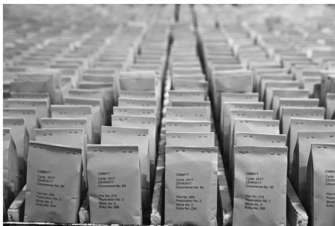
Figure 11.3 Accessions stored in the gene bank of the International Maize and Wheat Improvement Center (CIMMYT), Mexico, 2018.

Chapter 10, this volume), “minimum standard” protocols for plant exploration, and information-sharing activities. 42 These actions were directed by five ad hoc committees for the crops with the greatest economic importance: wheat, maize, rice, sorghum, and a single combined committee for millets and beans. 43 As Erna Bennett later reflected, these patterns confirmed that IBPGR followed the orientation dictated by the plant breeders’ epistemic culture: