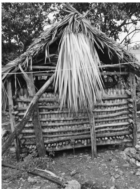
Figure 11.5 A maize granary in Yucatan, Yaxcaba, Mexico represents on-farm (or in situ ) conservation of crop diversity, 2013.

and providing genetic materials to breeding companies but providing opportunities and solutions to farmers and their farming systems. In this scenario, gene banks and breeding programs finally had a role in directly supporting farmers. 90