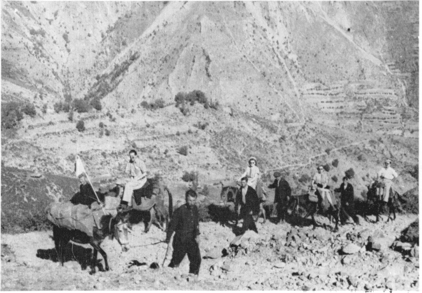
Red Cross boats for ferrying of supplies to Greek islands during Second World War.