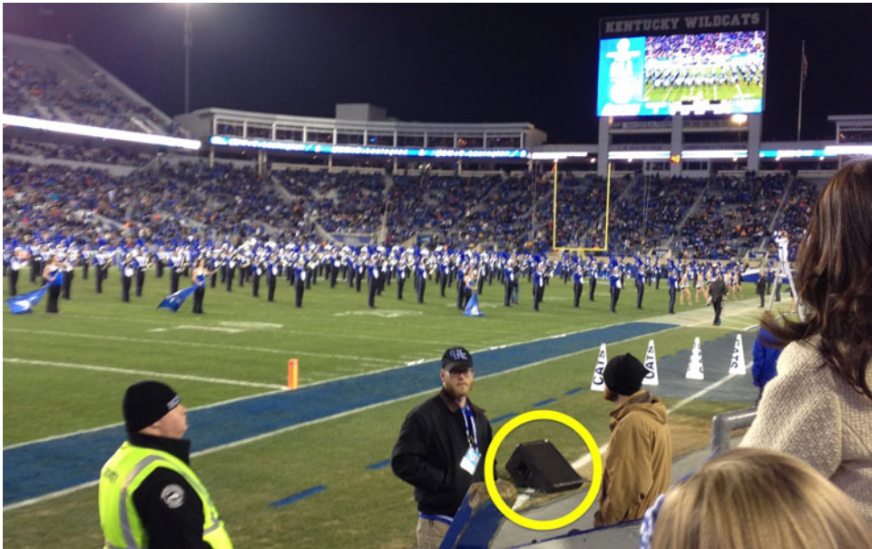
Figure 2. Field-Level Speakers (circled in yellow) at the University of Kentucky. November 30, 2013.

us get recruits, then we won't do it. . . . So, we try to make sure that recruits are on the field, recruits want to hear their music, and we're trying to impress seventeen-year-old kids at that point. [plays Yo Gotti's "Act Right"]. We're not trying to impress fans. We're not trying to make fans happy or sad. If fans don't like it, they can leave. We're trying to impress recruits during warm-ups. So, we play recruiting music. . . . If you go to a stadium, and you're a seventeen-year-old kid, and they're playing Robin Thicke and Britney Spears and shit like that, why would you go there? When I come here, and I know that warm-up/pregame I'm going to get hyped because I'm hearing Jeezy, and I'm hearing, you know, Rick Ross, and Ace Hood, all those things. It makes a difference, it really does. 29