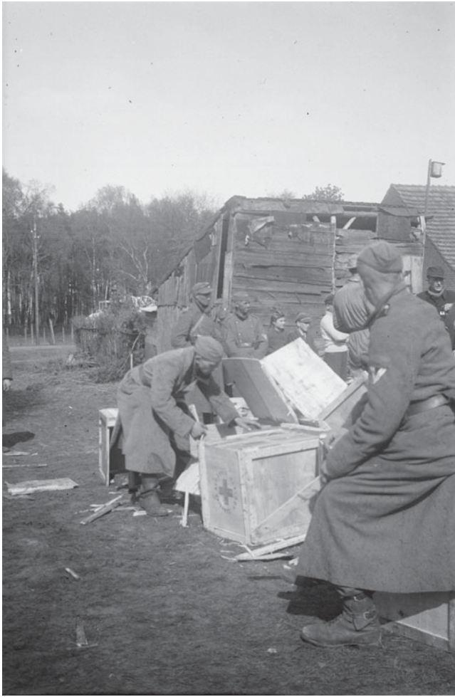
World War II. Death march from Oranienburg-Sachsenhausen to the Wittstock concentration camps. A crate of Red Cross parcels is opened by German guards.

managed to distribute a large shipment of parcels to evacuees. 63 According to the report from the ICRC Transport Service, the convoy made two distributions of food in Below Forest (on 27 and 30 April) of 56,000 kg each. 64 Those distributions were made pursuant to a request from SS-Obersturmbannführer Rudolf Höss. 65 This suggests that the Germans were using the relief supplies to facilitate the detainees'