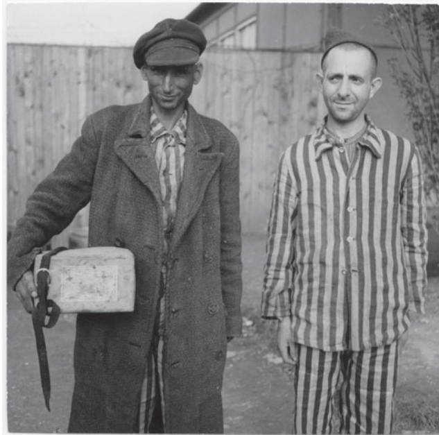
World War II. Detainees with a Red Cross parcel at Dachau concentration camp shortly after its liberation.

Rubli was in charge of convoy 36, which was held up at the border (23 Avril) by the Swiss authorities from 5 p.m. to 10 a.m. the following morning. The former detainees were forced to spend the night on the road, without blankets, hot drinks or food. Rubli also spoke of the lack of sanitary facilities and shelter and the transfer of the evacuees into third-class rail cars. 106 More generally and except for the work of a delegate by the name of Hort, who took it upon himself to provide first aid for 500 detainees in Landsberg, 107 the ICRC made only a modest contribution to the various medical missions undertaken to save released detainees. For example, Jean Rodhain, chaplain general for prisoners of war and deportees in France, organised three medical missions to Bergen-Belsen, Dachau, Mauthausen and Buchenwald. 108 The British Red Cross mobilized five teams in Bergen-Belsen, backed by British Quakers. 109 The ICRC, for its part, dispatched a team made up of