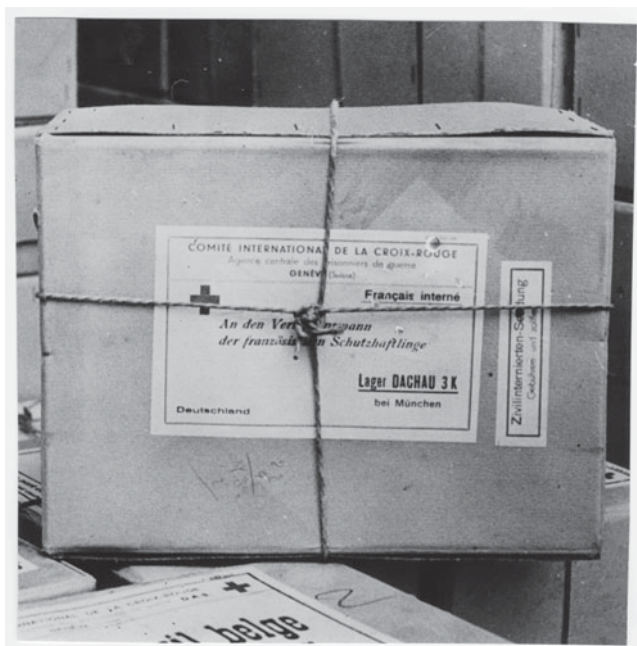
World War II. ICRC parcel for French deportees at Dachau.