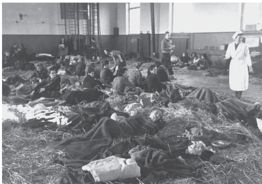
World War II. Kreuzlingen. Detainees from Ravensbrück concentration camp are housed in a gym after their evacuation by the ICRC.