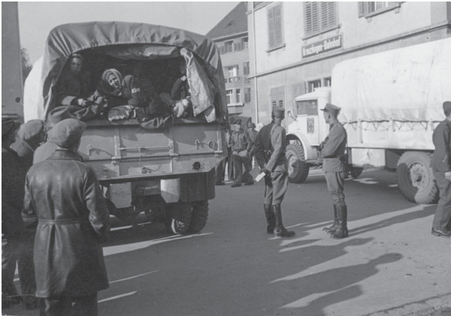
World War II. Kreuzlingen. 300 women released from Ravensbrück concentration camp arrive in Switzerland on board ICRC trucks.

Polish 74 female detainees in exchange for the release in France of 454 German civilians. 75