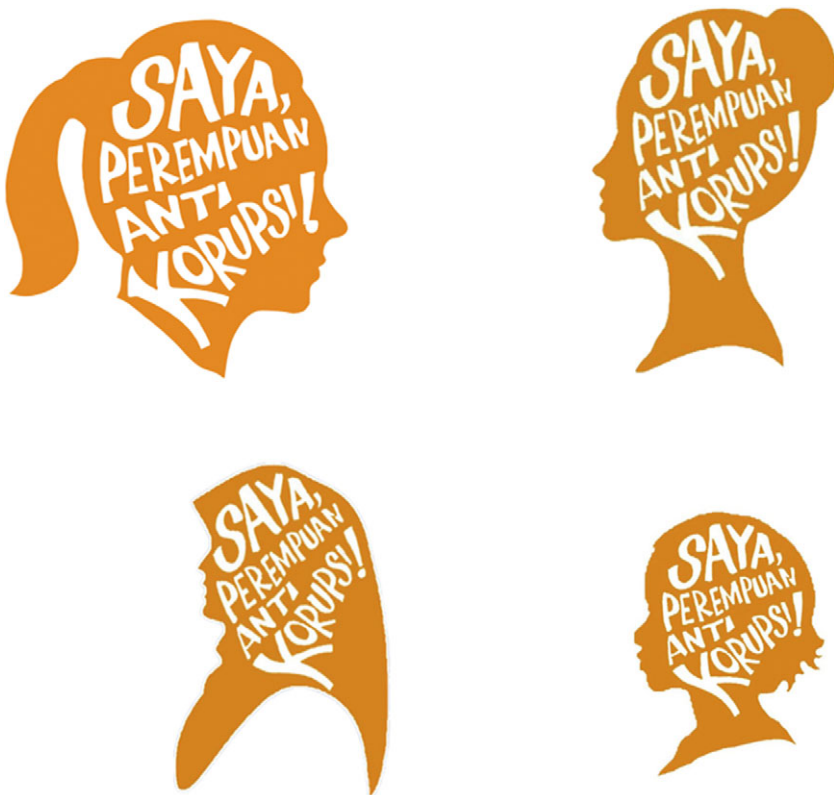
Figure 11. A selection of profiles of women's heads in profile designed to invite everyday Indonesian women to recognize themselves as participants in efforts to fight corruption. At http://www.spakindonesia.org (accessed 3 July 2022, but it is no longer online).