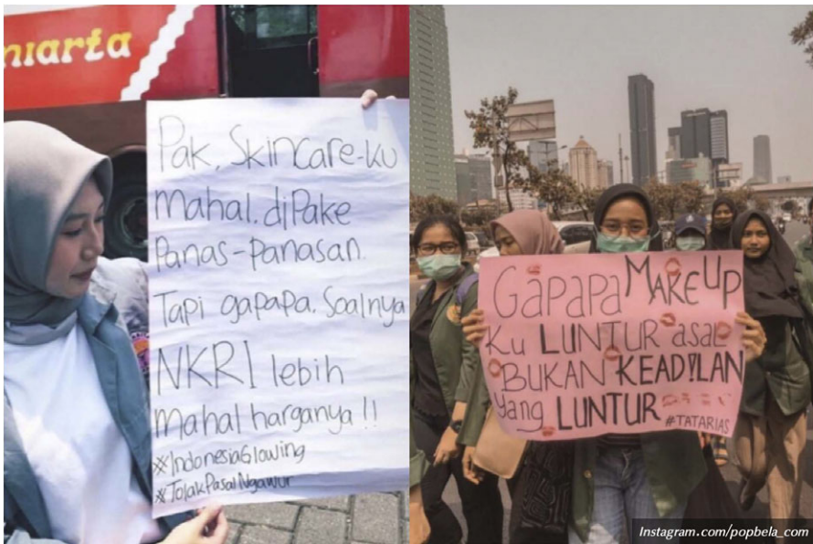
Figure 10. Collages of young women that circulated with versions of the phrase, "Mister, my skincare is expensive. Wearing it just makes me hotter. But I don't mind because NKRI is even more valuable"; or "I don't mind if my makeup wears off, as long justice never wears off," September 2019; @popbela.