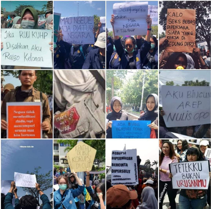
Figure 9. Collage of protesters' signs that circulated widely via WhatsApp in September and October of 2019.

Over six days of coordinated protests across the country, from 24–30 September (the last week of the parliamentary session), students tied their resistance, their demands, and their humor to the laws as a pair. By highlighting the hypocrisy of making private sexual life subject to state surveillance while making theft of public goods potentially more private and safer, protesters' aesthetics included consistent themes in their posters and dress styles. Their posters pointedly asked, "If extramarital sex results in imprisonment, who will be left to serve in the legislature?" "Making corruption easier while making love harder." "Sex gets you jailed. Corruption just gets you a vacation," and "Brokenhearted but still protesting." Many of the same phrases appeared at multiple protest sites, conveying the coordinated, viral strategy of what was also a national resistance movement known as Aliansi Rakyat Bergerak (People's Movement Alliance), (see figure 9).