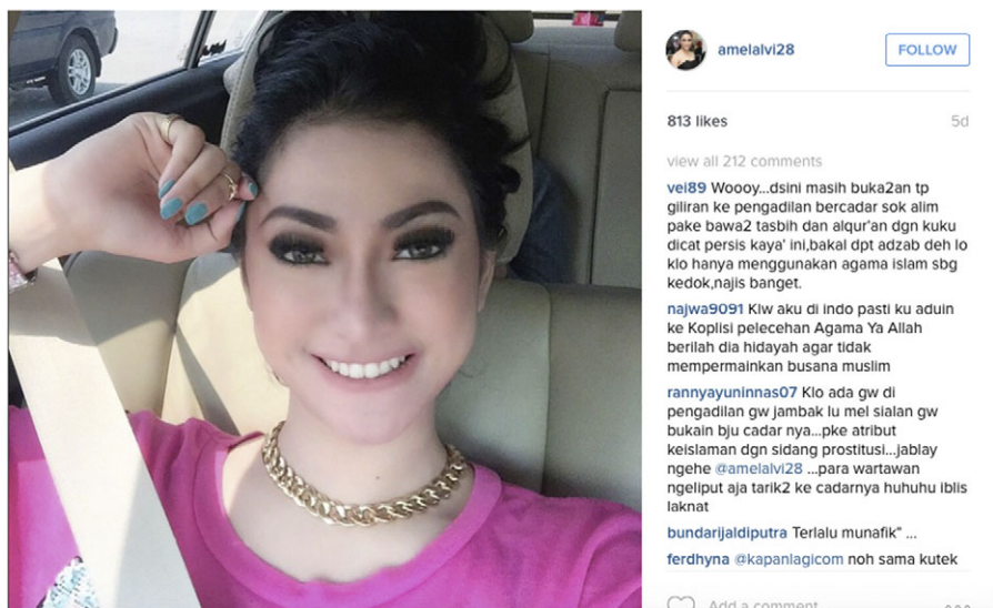
Figure 3. Celebrity entertainer Amel Alvi in selfie taken the evening before her trial, 30 September 2015; @amelalvi28.