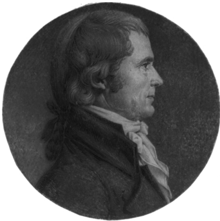
John Marshall, U.S. Supreme Court Chief Justice 1801–1835. Illustration: Library of Congress.

thwart consideration of the repeal of the Judiciary Act of 1801, the next term of the Supreme Court was set for February, 1803, meaning it could not meet until then (Morison 1965; Smelser 1968).