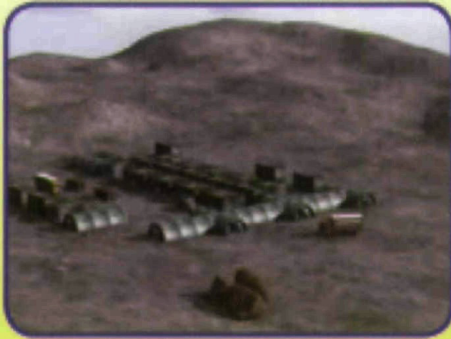
Norlense inflatable tents