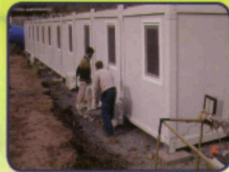
MSF Hospital, Hattian Bala, Pakistan