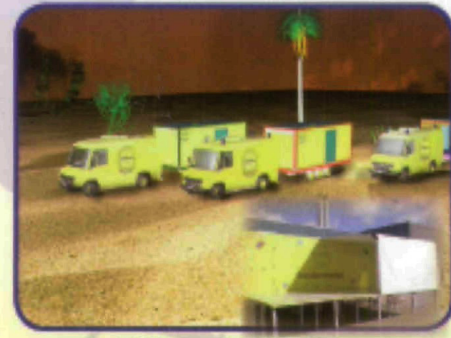
All kinds of Mobile Clinics