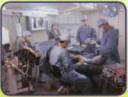
NorBase single and expandable containers