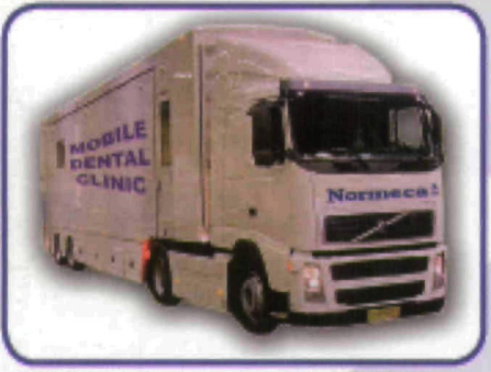
All kinds of clinics or hospitals in MultiSpace