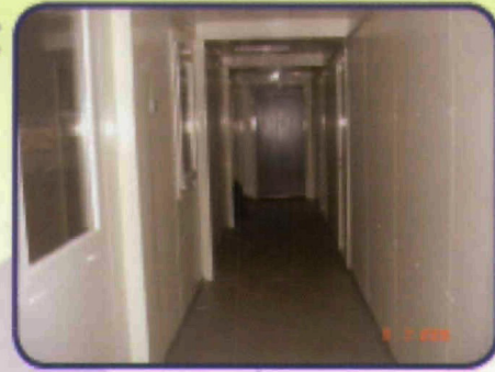
Inside MSF Hospital in Hattian Bala

Number One in the world within partly and turn key solutions incl. Transportation, Erection, Management, Training, Maintenance, Education, Administration, Storage, Out sourcing, Medivac, etc.