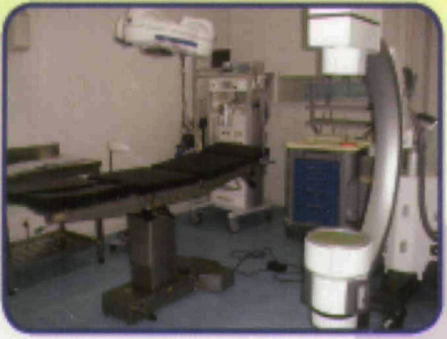
Inside OT in KATIKO Referral Hospital