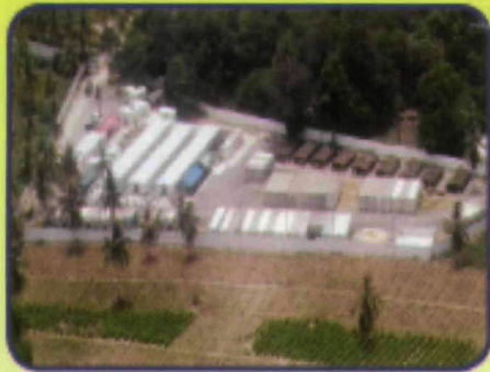
Thai Tsunami Victims Identification Centre