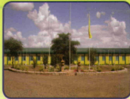
KATIKO Referral Hospital, Southern Sudan