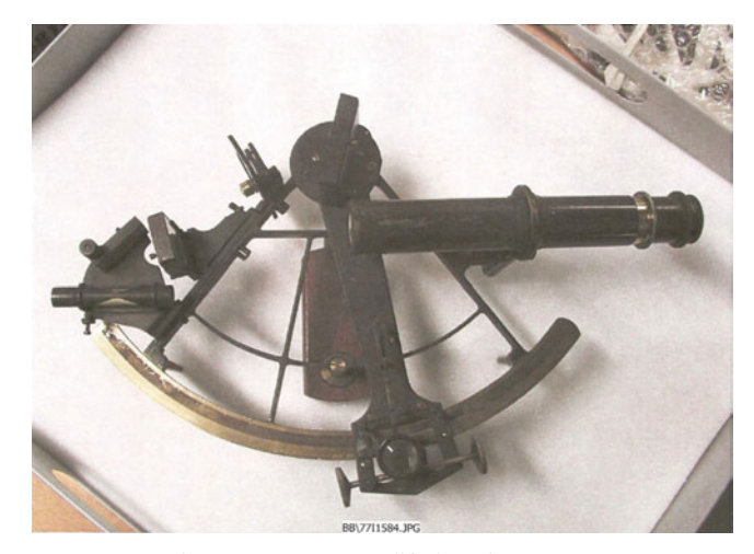
Figure 1. Brown's modified marine sextant.

underneath the aircraft and had been designed so that it could be used as a life raft should the need arise.