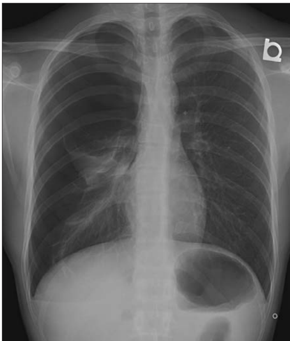
Fig. 1. Initial x-ray, revealing a large pneumothorax.

For the Answer to this Challenge, see page 230.