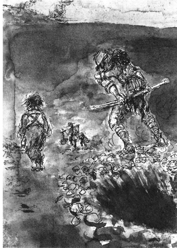
A woman who lost her legs is carried by a Japanese soldier.

Moving by night in search of a shelter, we came under heavy enemy fire and dropped down for cover. As usual, when it let up, we checked with each other to make sure everyone was all right. Our family was safe, but a woman we didn't know who'd begun traveling with us had fallen into a shell hole just gouged in the ground. She was screaming and writhing in pain. "My daughter is waiting for me in the forest. Take me to her!" she begged. Then we saw she had lost both her legs. We all felt sorry for her, yet by this time no one had the strength or will to do anything but save themselves, not even to help her out of that shell hole. A Japanese soldier who just happened to be passing by lifted her legless body onto his back, and resumed walking using his army sword to hold her in place. Shredded pieces of flesh and gobs of blood fell from her torso, staining his uniform and gaiters a dark red. She continued saying that her daughter was waiting in the forest as the soldier carried her along until she fell unconscious and stopped breathing. It must have given her comfort, as she rode on that soldier's back, to hope that she would be able to see her daughter again.