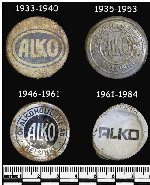
Figure 6. The 'bottle-top chronology' with finds from Vaakunakylä.

but, based on our contemporary archaeological explorations, alcohol bottle tops are among the most common finds in all twentieth-century contexts in Finland. We can trace what was consumed in different households based on the bottle tops and they also serve as horizon markers. We have established in our research a 'bottle-top chronology' based on the finds from Vaakunakylä that works as a tool for dating twentieth-century sites across Finland (Kelloniemi 2023) (Figure 6).