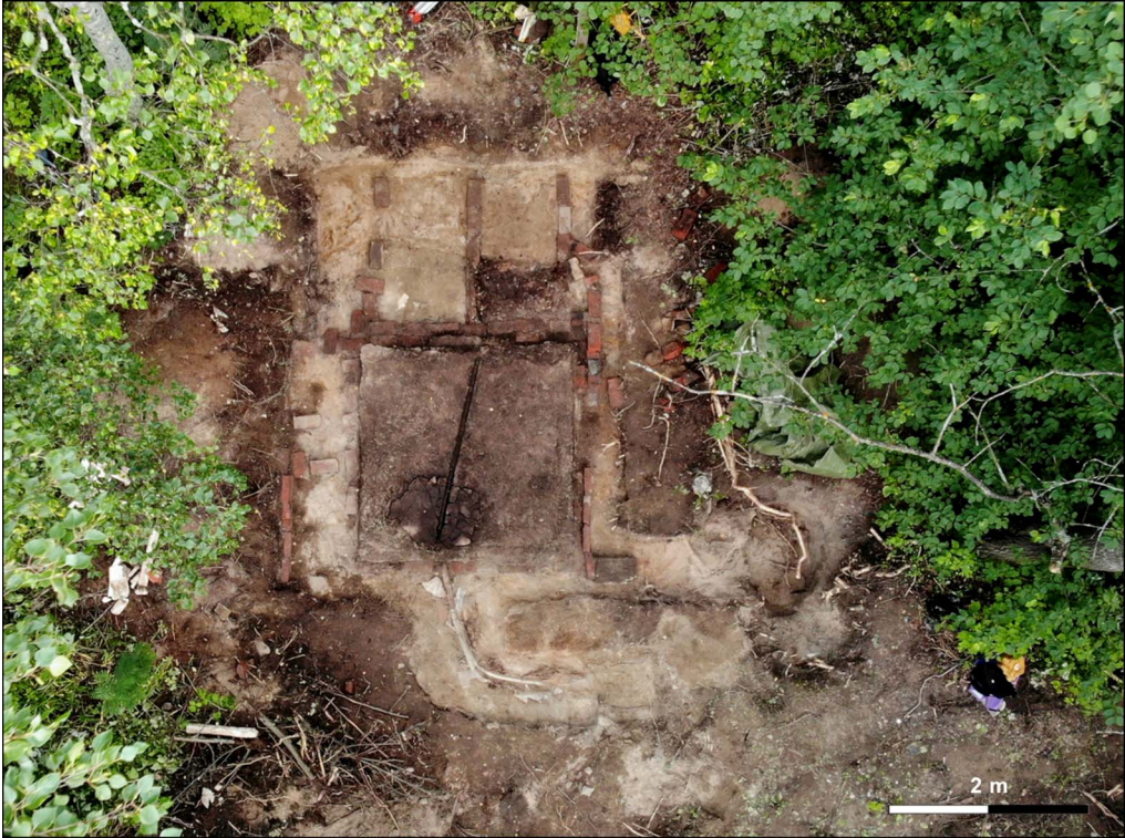
Figure 3. Foundations of a German laundry barrack turned into a sauna.

philosophy, where nature became viewed as a commodity for public consumption (Matila et al. 2021). Also, the stigma attributed to Vaakunakylä of co-operating with the Nazis did not help. The City of Oulu had already taken measures to conceal the last reminders of Nazi past from the local landscape (Ylimaunu et al. 2013).