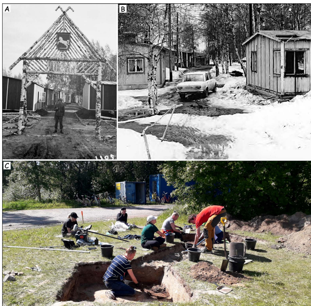
Figure 2. A) German soldier standing guard in Vaakunakylä during the war; B) Vaakunakylä in the early 1980s; C) field-school participants excavating the wartime horse-stable foundations at Vaakunakylä.

therefore, the Vaakunakylä barracks were preserved. In the late 1940s, Finns who were left homeless by the war moved into the barracks (Figure 2).