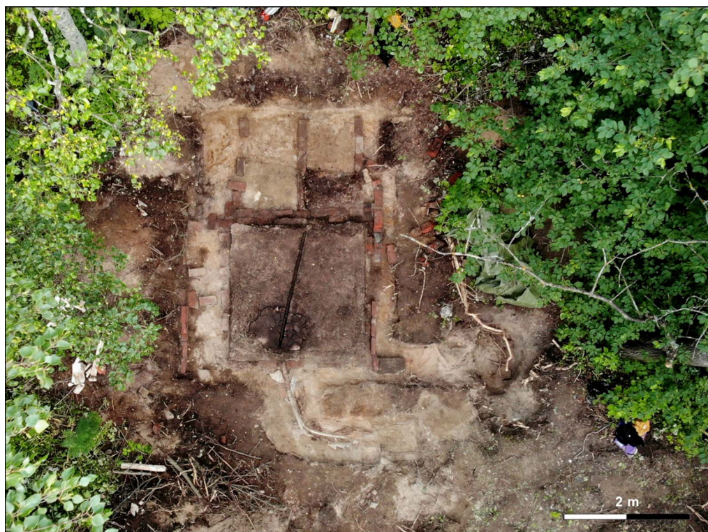
Figure 3. Foundations of a German laundry barrack turned into a sauna.

philosophy, where nature became viewed as a commodity for public consumption (Matila et al. 2021). Also, the stigma attributed to Vaakunakylä of co-operating with the Nazis did not help. The City of Oulu had already taken measures to conceal the last reminders of Nazi past from the local landscape (Ylimaunu et al. 2013).