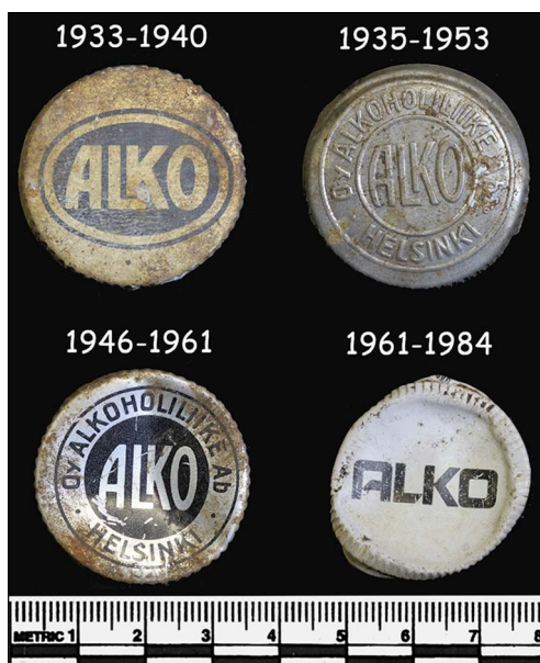
Figure 6. The 'bottle-top chronology' with finds from Vaakunakylä.

but, based on our contemporary archaeological explorations, alcohol bottle tops are among the most common finds in all twentieth-century contexts in Finland. We can trace what was consumed in different households based on the bottle tops and they also serve as horizon markers. We have established in our research a 'bottle-top chronology' based on the finds from Vaakunakylä that works as a tool for dating twentieth-century sites across Finland (Kelloniemi 2023) (Figure 6).