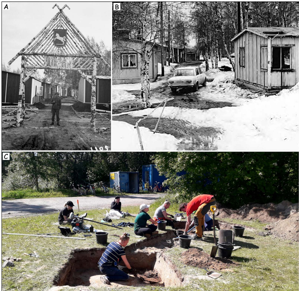
Figure 2. A) German soldier standing guard in Vaakunakylä during the war; B) Vaakunakylä in the early 1980s; C) field-school participants excavating the wartime horse-stable foundations at Vaakunakylä.

therefore, the Vaakunakylä barracks were preserved. In the late 1940s, Finns who were left homeless by the war moved into the barracks (Figure 2).