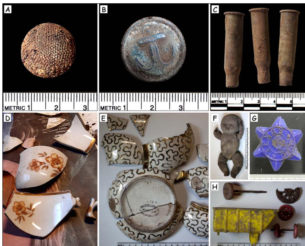
Figure 5. Finds from Vaakunakylä. A) German military button; B) Soviet military button; C) cartridges; D) Arabia Myrna cup fragments; E) fragments of a Sudlow's teapot; F–H) toys.

Numerous rubbish pits located in the area helped in reconstructing day-to-day family life. Only a few wartime finds were made, which is understandable as the Germans were in the area only for a couple of years and Finns lived there for four decades (Figure 5A–C). Pits contained mostly household waste, as there was no municipal garbage management in Vaakunakylä, which indicated variation between households in terms of possessions. For instance, sherds of high-end porcelain sets (Figure 5D & E) suggest that at least some Vaakunakylä residents could afford non-essential commodities to improve their living standards. Based on finds and recollections, locals took pride in their living spaces and were comfortable enough to entertain guests, which contrasts clearly with outsiders' low opinions of poorer areas.