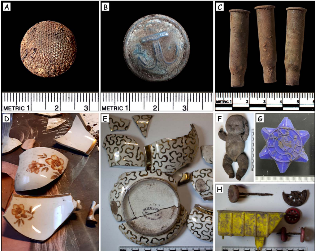
Figure 5. Finds from Vaakunakylä. A) German military button; B) Soviet military button; C) cartridges; D) Arabia Myrna cup fragments; E) fragments of a Sudlow's teapot; F–H) toys.

Numerous rubbish pits located in the area helped in reconstructing day-to-day family life. Only a few wartime finds were made, which is understandable as the Germans were in the area only for a couple of years and Finns lived there for four decades (Figure 5A–C). Pits contained mostly household waste, as there was no municipal garbage management in Vaakunakylä, which indicated variation between households in terms of possessions. For instance, sherds of high-end porcelain sets (Figure 5D & E) suggest that at least some Vaakunakylä residents could afford non-essential commodities to improve their living standards. Based on finds and recollections, locals took pride in their living spaces and were comfortable enough to entertain guests, which contrasts clearly with outsiders' low opinions of poorer areas.