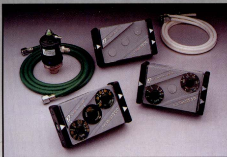
The LSPI AutoVent Series.