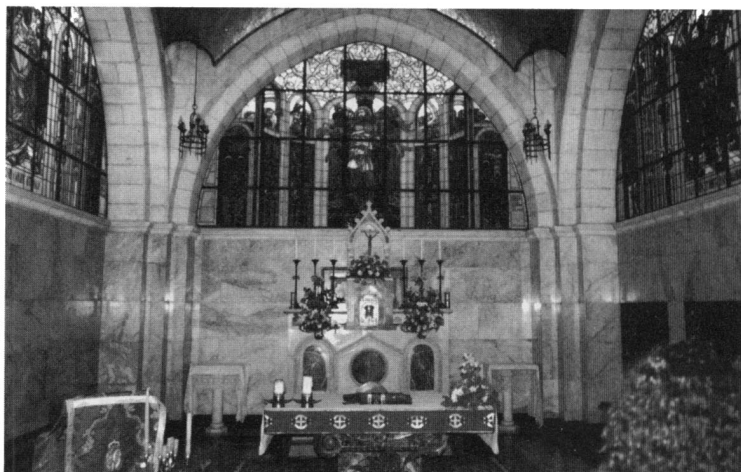
St. Anne's Church, located in the Muslim Quarter of Jerusalem, was built in 1140 and is noted today for its exceptional acoustics.

Sepulchre, the church of Christ the peacemaker, in which six sects wage their cold war.