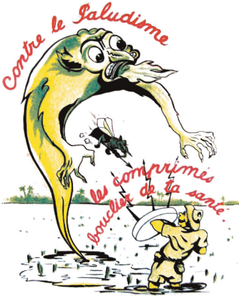
Illustration 2: Military anti-malaria propaganda poster