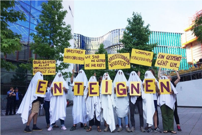
Figure 3.1 The spectres of expropriation in front of the Deutsche Wohnen Headquarters in Frankfurt, 18 June 2019