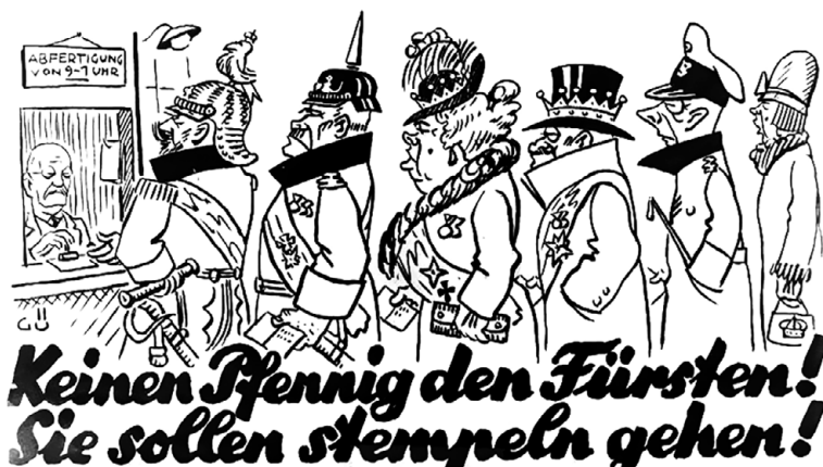
Figure 3.8 Poster for the 1926 referendum to expropriate the property of the former ruling houses (Translation: "Not a penny for the princes! Let them apply for unemployment benefits!")

The Berliner Albert Einstein voted 'Yes' in the expropriation referendum. The physicist was a vocal supporter of the 1926 referendum to expropriate the property of the former ruling houses without monetary compensation (Figure 3.8). The petition for the referendum ( Volksbegehren ) was organised jointly by