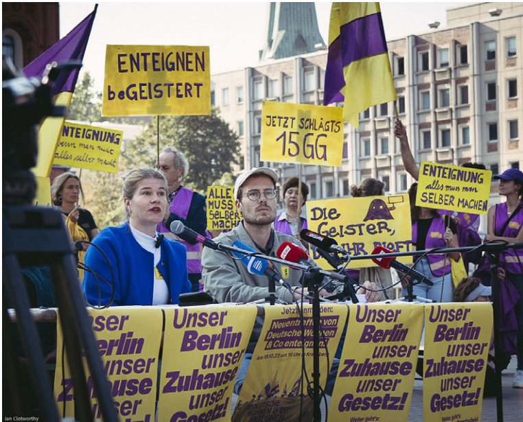
Figure 3.5 DWE announces the second referendum in front of the Rotes Rathaus (Berlin City Hall), 23 September 2023

Wegner of the Christian Democrats (CDU) – have opposed socialisation. Their resistance is hardly surprising: both their parties have been receiving campaign funding from the real estate lobby. The only way to bypass the government’s inaction is to write the law ourselves and put it to a direct vote.