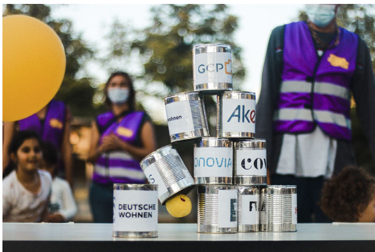
Figure 3.3 Election evening games: Will it be possible to overthrow the rule of corporate landlords?

The spectres of expropriation materialised in the daytime. These were real, human ghosts, down-to-earth and dressed for the job, in white bedsheets with cut-out holes for their eyes.