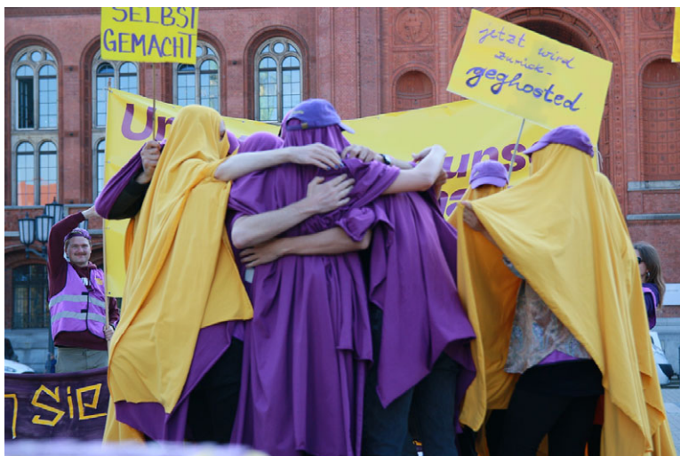
Figure 3.6 ‘We have to do everything ourselves’: The spectres of expropriation dancing in front of the Rotes Rathaus

reality, then empowers these fictions to transform reality. That a corporation can count as a person is a legal fiction with real-life consequences. But rights are legal fictions as well. As suggested by Eric Voegelin, the idea of constitutionally guaranteed rights may be nothing more than a superstitious belief in the power of law. 12 For what does a constitutional right to socialisation mean if nothing has been socialised?