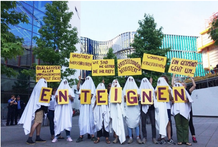
Figure 3.1 The spectres of expropriation in front of the Deutsche Wohnen Headquarters in Frankfurt, 18 June 2019