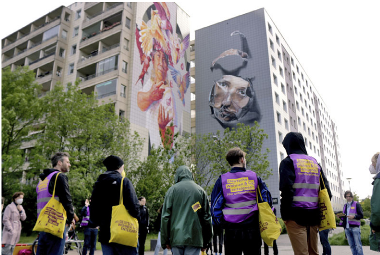
Figure 3.4 Collecting signatures in Berlin-Marzahn

Almost 350,000 signatures – more than twice as many as were needed to organise the referendum – were collected between February and June 2021, amid intermittent lockdowns, without mass events, and with lousy weather persisting until mid-May. The Kiezteams competed internally to get record numbers of signatures, while also supporting one another, sending activists from the central districts to help also in the neighbourhoods on the periphery (Figure 3.4). Then, in the run-up to the referendum, the Kiezteams campaigned door-to-door. Door-to-door campaigning is very unusual in German culture. But the ground for this had been prepared when the ‘Jumpstart’ group was teaching tenants how to organise themselves, back when expropriation still looked like a big, bold nothing. Or like a spectre: down-to-earth, and dressed for work.