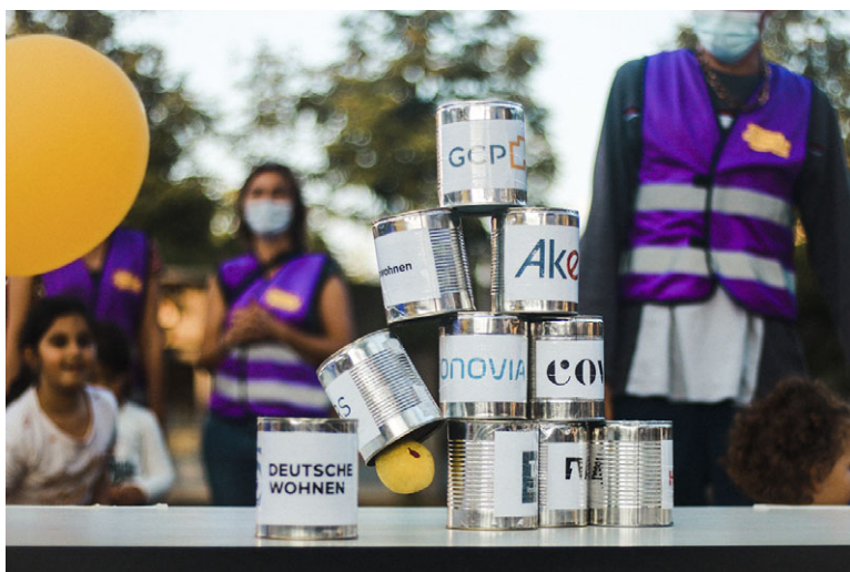
Figure 3.3 Election evening games: Will it be possible to overthrow the rule of corporate landlords?

The spectres of expropriation materialised in the daytime. These were real, human ghosts, down-to-earth and dressed for the job, in white bedsheets with cut-out holes for their eyes.