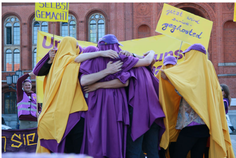
Figure 3.6 ‘We have to do everything ourselves’: The spectres of expropriation dancing in front of the Rotes Rathaus

reality, then empowers these fictions to transform reality. That a corporation can count as a person is a legal fiction with real-life consequences. But rights are legal fictions as well. As suggested by Eric Voegelin, the idea of constitutionally guaranteed rights may be nothing more than a superstitious belief in the power of law. 12 For what does a constitutional right to socialisation mean if nothing has been socialised?