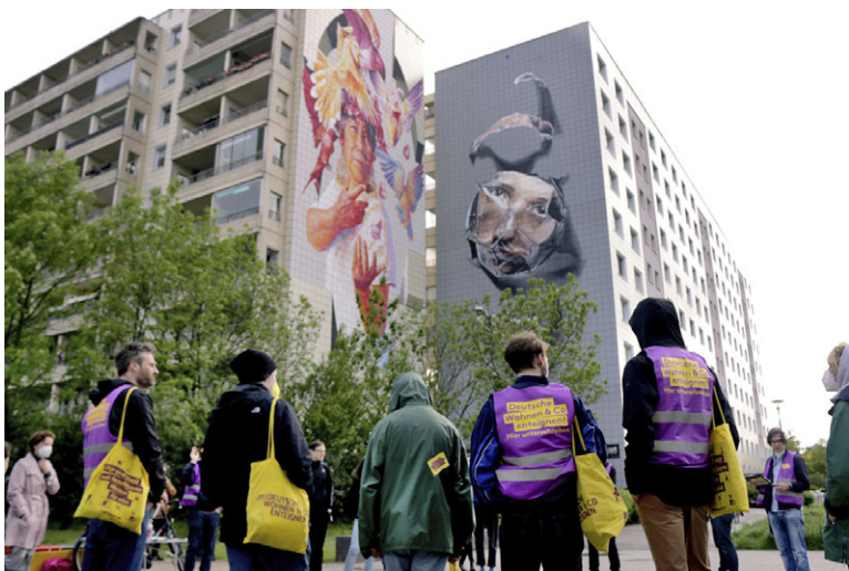
Figure 3.4 Collecting signatures in Berlin-Marzahn

Almost 350,000 signatures – more than twice as many as were needed to organise the referendum – were collected between February and June 2021, amid intermittent lockdowns, without mass events, and with lousy weather persisting until mid-May. The Kiezteams competed internally to get record numbers of signatures, while also supporting one another, sending activists from the central districts to help also in the neighbourhoods on the periphery (Figure 3.4). Then, in the run-up to the referendum, the Kiezteams campaigned door-to-door. Door-to-door campaigning is very unusual in German culture. But the ground for this had been prepared when the ‘Jumpstart’ group was teaching tenants how to organise themselves, back when expropriation still looked like a big, bold nothing. Or like a spectre: down-to-earth, and dressed for work.