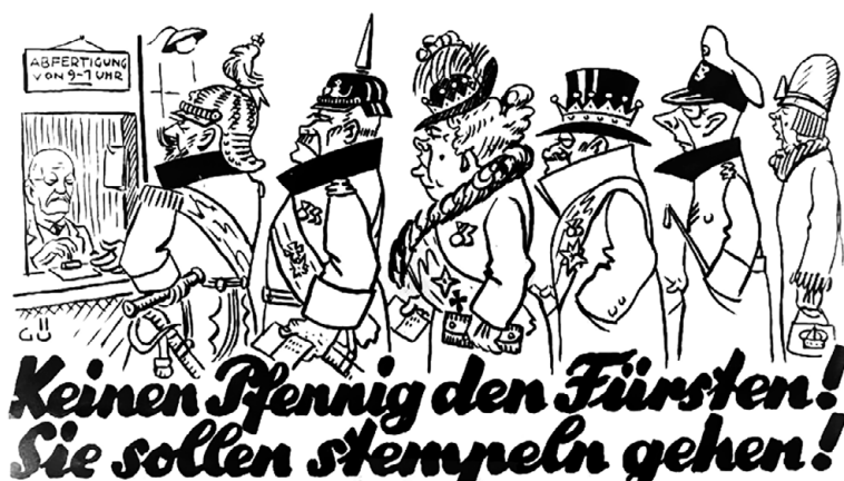
Figure 3.8 Poster for the 1926 referendum to expropriate the property of the former ruling houses (Translation: "Not a penny for the princes! Let them apply for unemployment benefits!")

The Berliner Albert Einstein voted 'Yes' in the expropriation referendum. The physicist was a vocal supporter of the 1926 referendum to expropriate the property of the former ruling houses without monetary compensation (Figure 3.8). The petition for the referendum ( Volksbegehren ) was organised jointly by