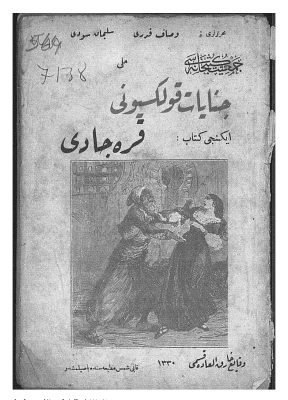
Figure 2. Cover of Kara Cadı (Dark Witch).

and candles. The names of the villainous mother and daughter as well as the black and the red shawls that they are wrapped in reinforce this oriental imagery (Fig. 2).