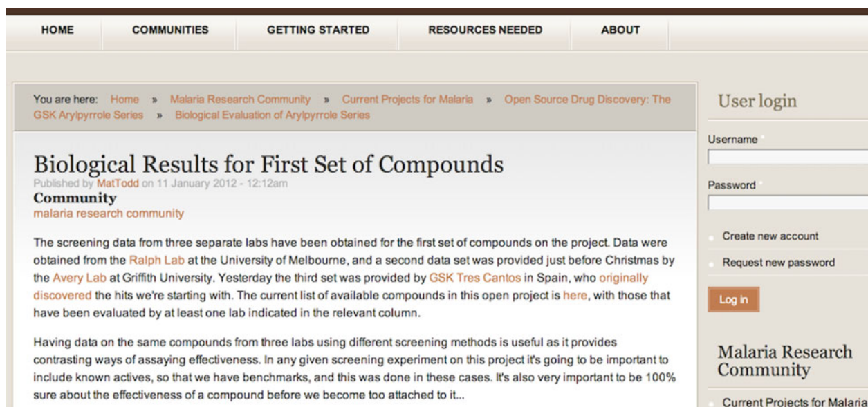
Fig. 4. The Synaptic Leap, a coordination site allowing project discussion and updates.

in this way has a democratising or levelling effect that undercuts the traditional academic monikers—thus for example in comments under a post in the malaria project (Fig. 4) ( http://www.thesynapticleap.org/node/367 ) an undergraduate student and a professor who had never met were able to discuss openly a point of theory about the data without it ever mattering who was who.