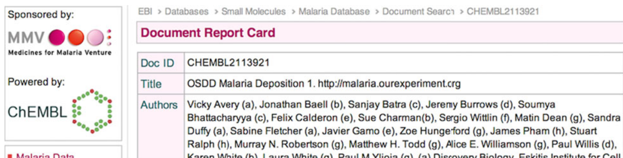
Fig. 3. Deposition of data in openly-available online databases enhances discoverability.

for the sharing of chemical and biological data (e.g. Figshare, Dryad, Pubchem, ChemSpider and other non-profit/commercial databases) or places where the data might usefully be incorporated (e.g. OpenPhacts). There are also valuable tools to prompt the machine discovery of chemical information in web pages that can then feed into the aforementioned resources (e.g. Chemicalize).