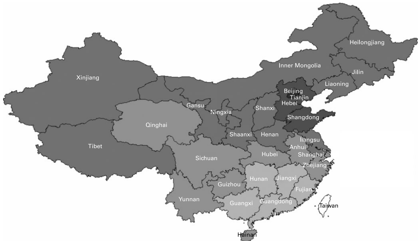
Fig. 2. BMI kg/m 2 in adults by regions in China. □, Missing or excluded; □, 20.00–20.99; □, 21.00–21.99; □, 22.00–22.99; □, 23.00–23.99; □, 24.00–24.99; □, ≥25.00. The South China Sea (Nan Hai) Islands are not shown on this map. The boundaries are only indicative and may not be accurate.

in the north ( r 0.871; 95% CI 0.660, 0.955) was stronger than that in the south ( r 0.489; 95% CI -0.056, 0.809). As expected, the prevalence of underweight was highest among the regions with low BMI, such as Guangxi, Jiangxi, Guangdong, Fujian and Yunnan.