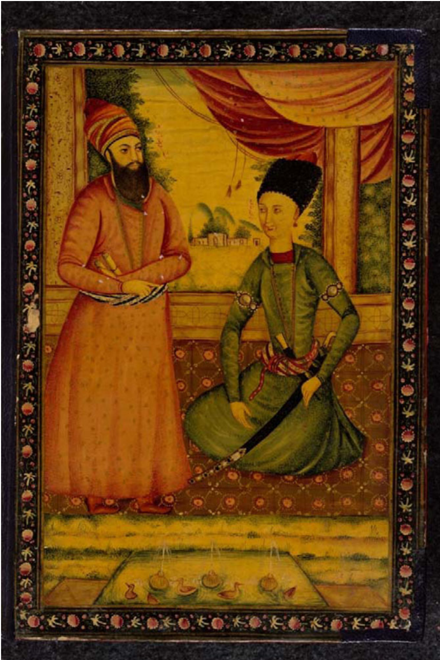
FIGURE 1. I'timad al-Dawlih (standing) with Agha Muhammad Khan. © The British Library Board. Inside back cover of Add. 24903, The British Library.