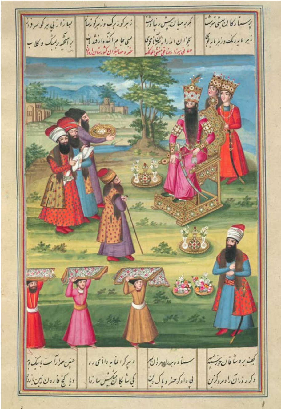
FIGURE 2. Mirza Riza Quli, the munshī al-mamālik , presenting gifts to Fath-'Ali Shah Qajar © The British Library Board. IO Islamic 3442, f 64v, The British Library.