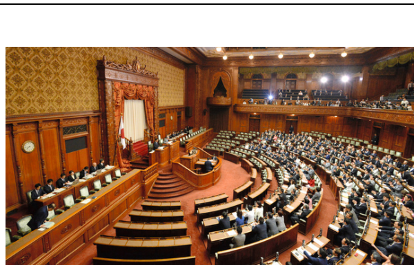
Passage of Anti-Conspiracy Bill in House of Councillors, June 15, early morning

—Following the State Secrecy Act and new security legislation, the Abe administration is aiming to force through the anti-conspiracy bill. What dangers do you think that presents?