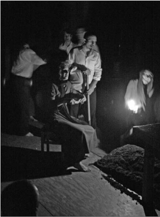
Gospels of Childhood .