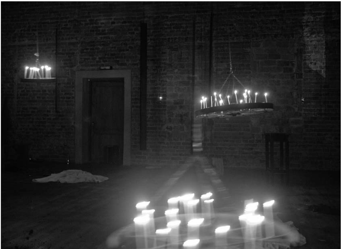
The concluding scenes of Gospels of Childhood .