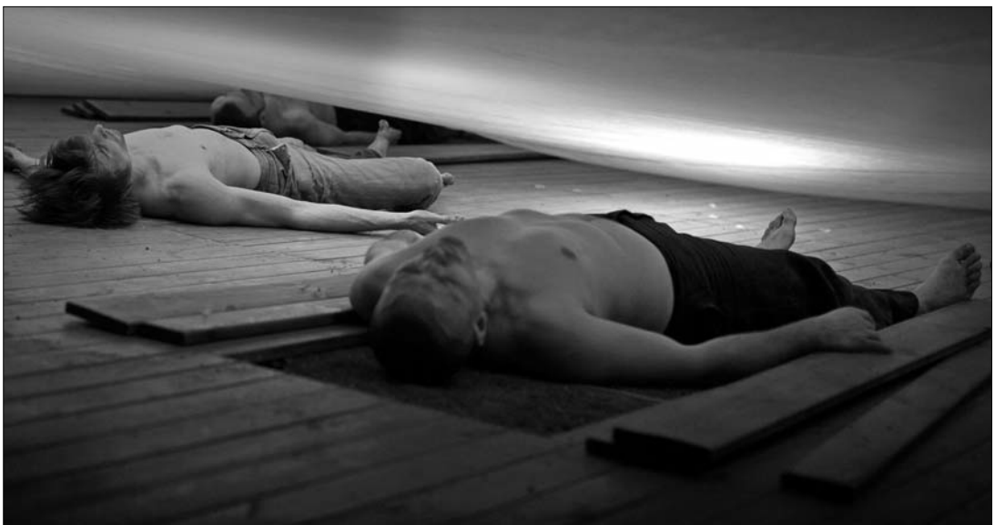
The concluding scene of Anhelli.