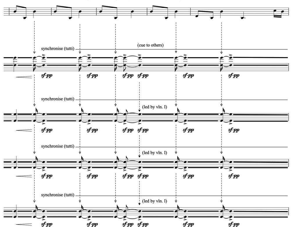
Example 15.3 Jieshi, before fig. N, string players operating in synchronisation.

play all the notes written out, with a large degree of flexibility regarding the duration of the notes. This operation is in some ways not dissimilar to jazz music where players improvise around a melody. To facilitate this notion of elasticity of the music, an unorthodox system of notation was required to coordinate the solo qin with the four Western string players. It was based on the principle that the qin player is the leader, a conductor of sorts. The string quartet players follow, or more appropriately, 'comment' on the music played by the qin player. The four string parts are for most of the time tied in with the qin part and operate mostly independently from each other (Example 15.2). There are also moments when the string players synchronise with each other to create a more unified sonic texture (Example 15.3).