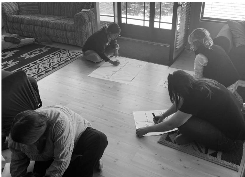
Photo 1. University workshop group creating environmental identity timelines.