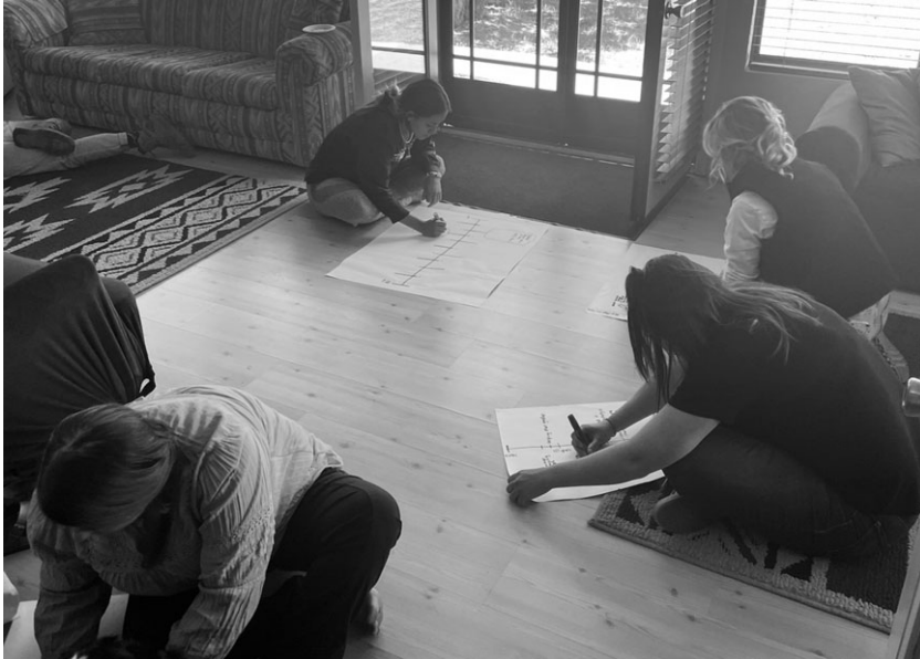
Photo 1. University workshop group creating environmental identity timelines.