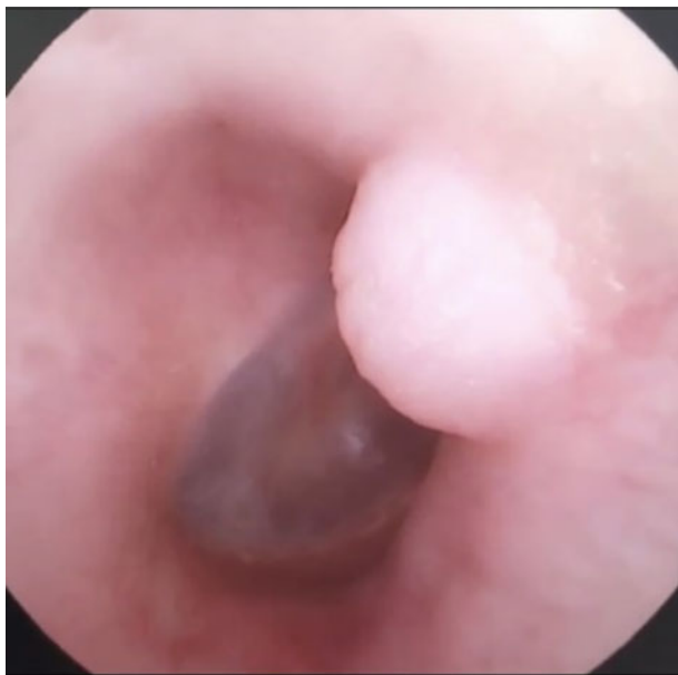
Figure 1. Endoscopic view of the right-sided external auditory canal lesion.

A computed tomography (CT) scan confirmed a defect in the right external auditory canal (Figures 2 and 3) with mucosal thickening in both maxillary antra. Magnetic resonance imaging (MRI) revealed an antero-superior bony defect (3.47 mm × 3.31 mm) within the right external auditory canal, with a small polyp connected to the right TMJ/parotid gland. To better characterise the bony defect, the radiology department suggested performing a CT scan during inspiration. This did not generate any improved images for review. As the patient's symptoms improved without treatment, she was managed conservatively.