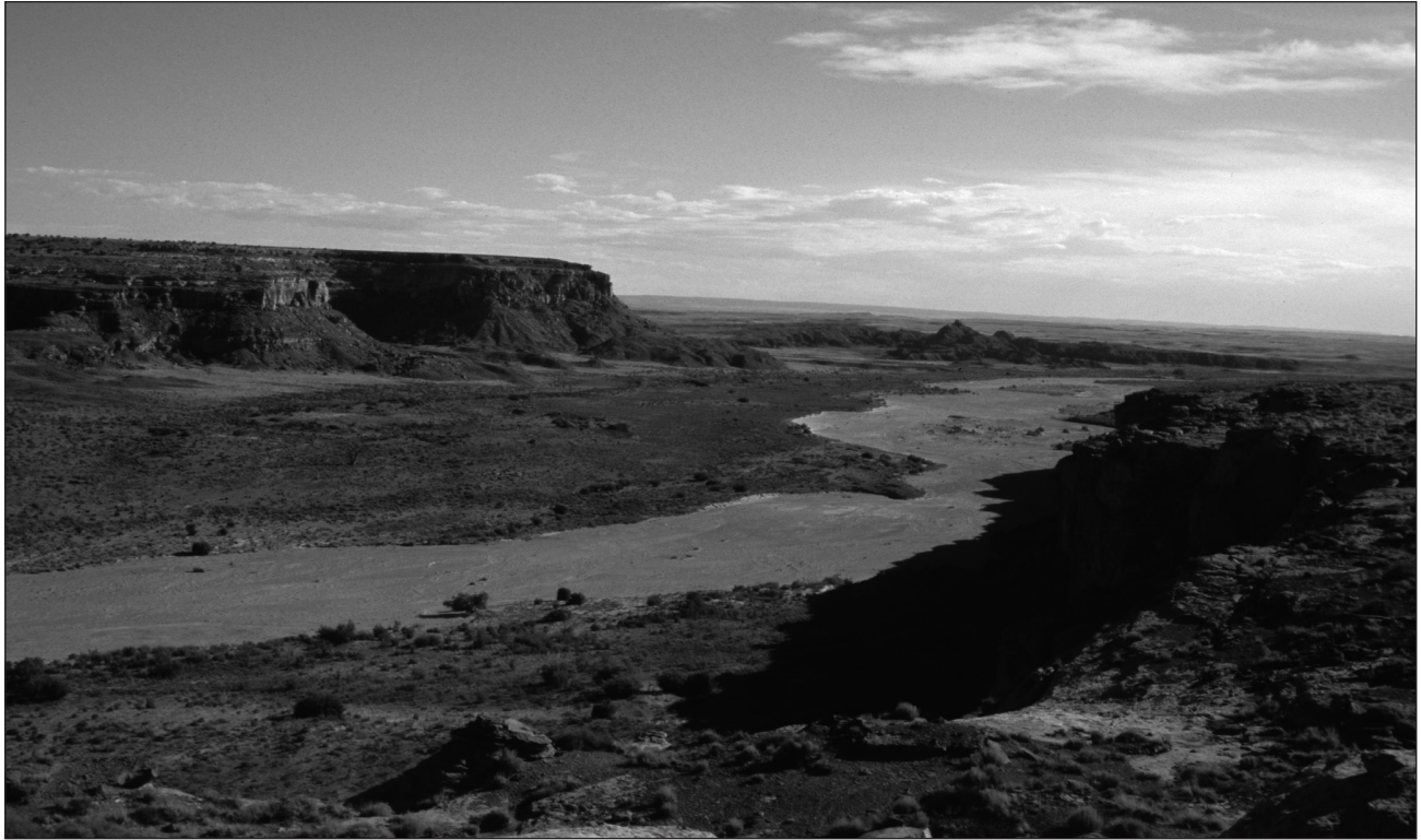
Figure 3. Overview of the west end of Chaco Canyon, looking south-southwest.

change that involves agency, strategy, and motivation, but is not mechanistic. What status quo were the Early Bonito phase Chacoans attempting to maintain? What was the tipping point?