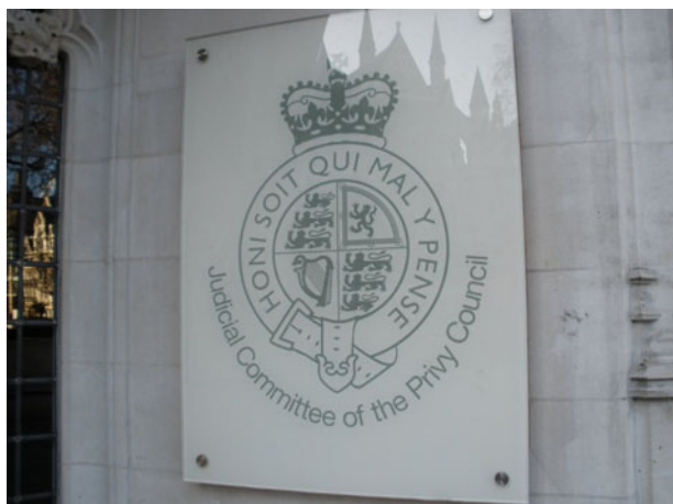
Figure 1: The Judicial Committee of the Privy Council.

continuing adoption and adaptation of common law itself. At the peak of its influence in the early 20 th century the JCPC was effectively the final court of appeal for more than a quarter of the global population. The JCPC judges apply the law of the country or territory from which the appeal has been received in reaching a majority decision on a given case.