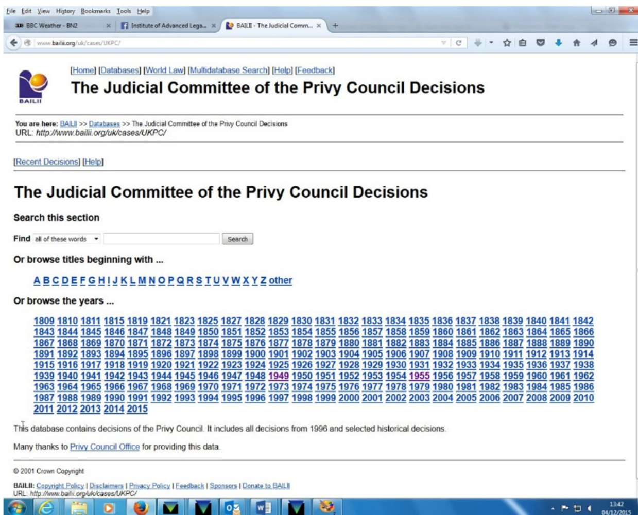
Figure 2: BAILII – The Judicial Committee of the Privy Council Decisions.