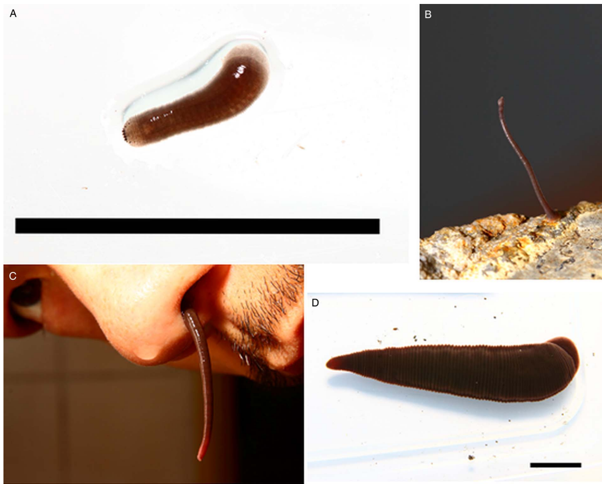
Fig. 1. Dinobdella ferox (Blanchard, 1896) in different periods of life history. A juvenile leech in rest pose (a) and in searching pose (b) before infestation, as well as an individual protruding the head out of the host nostril in the parasitic period (c) and an individual with genital pores resting in water after the parasitic period (d). The scales represent 1 cm in (A) and (D).

warm airflows of normal breathing of the host. The parasitic period of each juvenile D. ferox lasted for 49 days, 75 days and 24 days, respectively (Fig. 2). The parasitic period of the first leech was terminated after the leech was manually extracted from the nostril by the host on the 49th day after introduction (Fig. 2a). In contrast, the parasitic period of the second leech ended naturally on the 75th day after introduction, on which the leech exited voluntarily from the host's nostril into water (Fig. 2b). The third leech was discharged with the snivel already on the 15th day after introduction and reintroduced immediately into the host nostril. Nevertheless, after the third leech was repeatedly discharged from the nostril during sneezing on the 23rd and 24th days after introduction, the leech was not reintroduced to the host nostril and the parasitic period of the third leech was terminated (Fig. 2c).