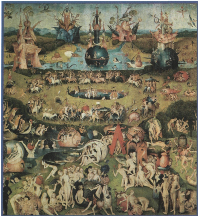
The Garden of Earthly Delights , by Hieronymus Bosch. Museo del Prado, Madrid, Spain.