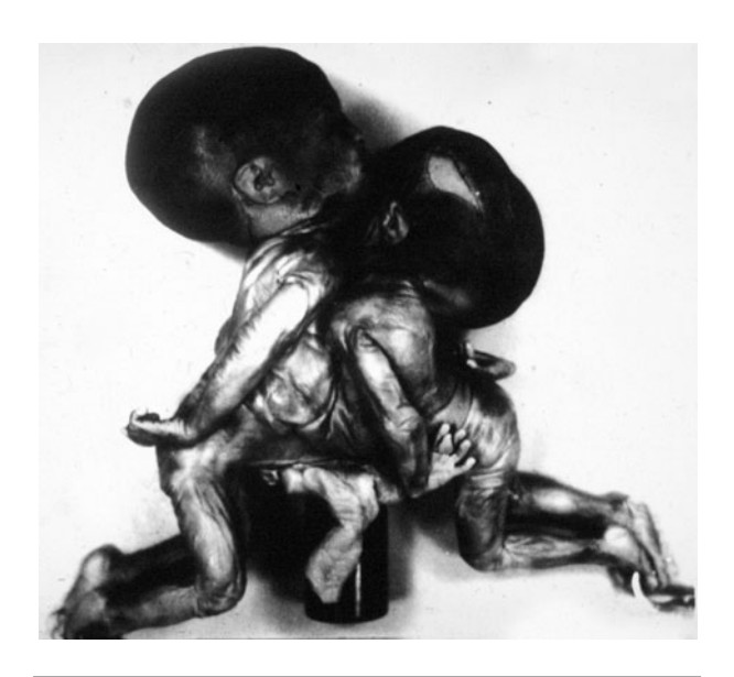
FIGURE 4 Thoracopagus conjoined twins.

of four triplets sets, based on combinations. The babies were conceived via in vitro fertilization. The quads were born 12 weeks premature, but their delivery was uneventful, with each newborn weighing approximately two pounds. The quadruplets and their family will be featured in an upcoming television series on TLC, scheduled to air in late 2015.