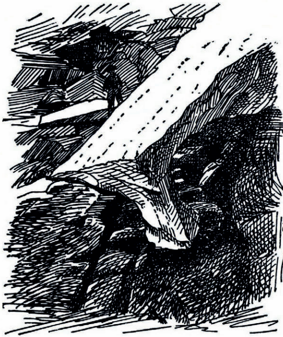
Fig. 2. Tuckerman snow-bed on 28 August 1861, from Hitchcock 22