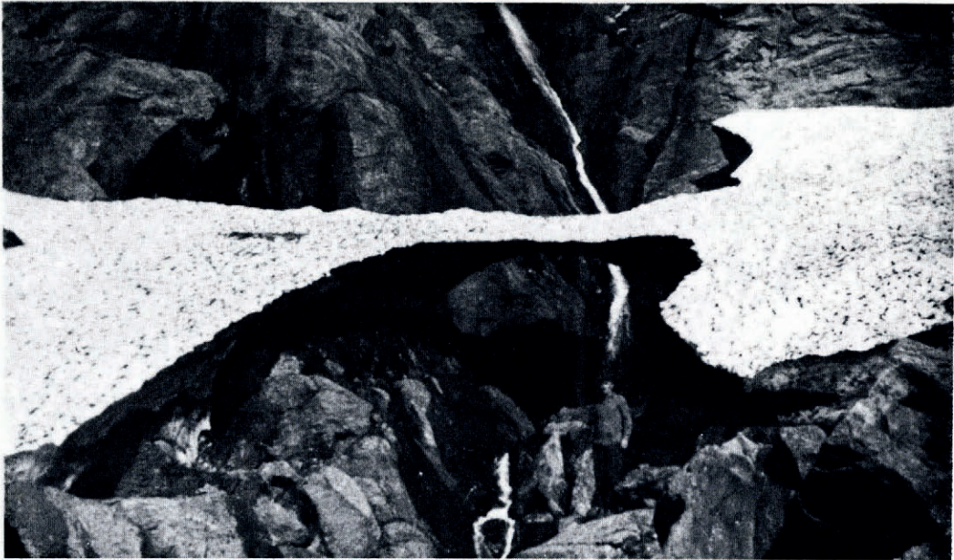
Fig. 4. Tuckerman snow-bed on 3 September 1926.