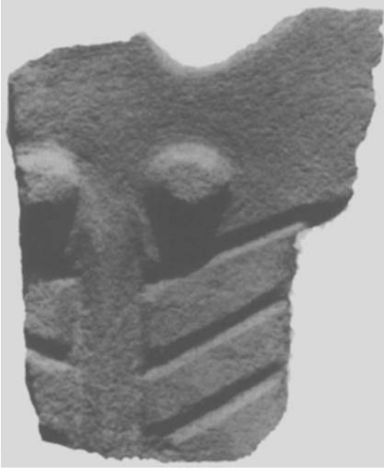
FIGURE 1. Excavated statue.