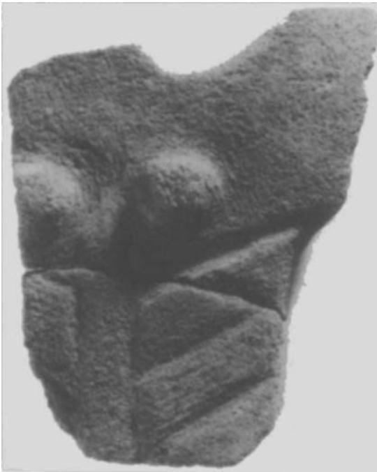
FIGURE 2. Fraud.

replied to this story of the anonymous amateurs in 1997 with a detailed refutation of this story, based on the slight but telling variations between the two figures (Holloway 1997). But even before the publications that appeared in 1997, including a renewed attack by Mannino in the same issue of Sicilia Archeologica for 1997 (Mannino, 1997b), the poison was already at work, spread by rumour, ' Fama malum qua non aliud velocius ullum ' (Virgil Aeneid IV: 175).