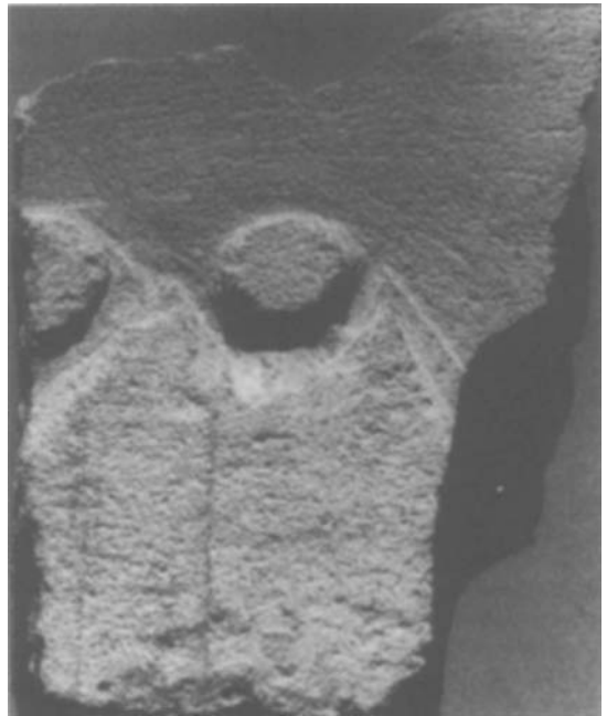
FIGURE 3. Fraud under development.

First, in the fraud the left breast of the figure is flattened. In the excavated piece it is fully conical. This difference is important because, if the photograph of the fraud were that of an earlier state of the excavated piece, it is impossible to explain how the fully rounded breast of the excavated piece appeared earlier in a flattened form. While it would have been possible to remove more stone from the figure, restoring the flattened breast to its conical shape that exists today — JUST AS IT WAS MADE WITH NO SIGN OF ANY REPAIR — is impossible.