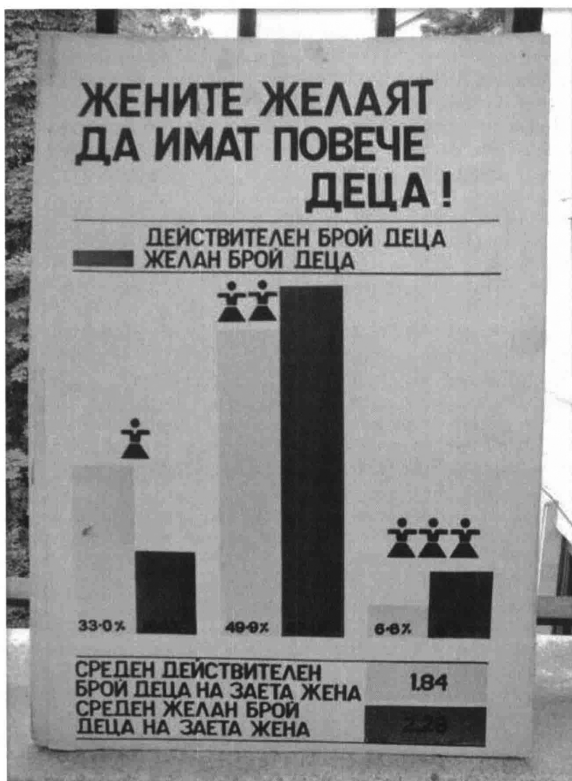
Figure 1. “WOMEN WANT TO HAVE MORE CHILDREN!” A handmade placard used to convince Todor Zhivkov and select members of the Bulgarian Politburo to expand social supports for working mothers.

found that while Bulgarian women in 1969 had an average of 1.84 children, they wanted to have an average of 2.28 children.