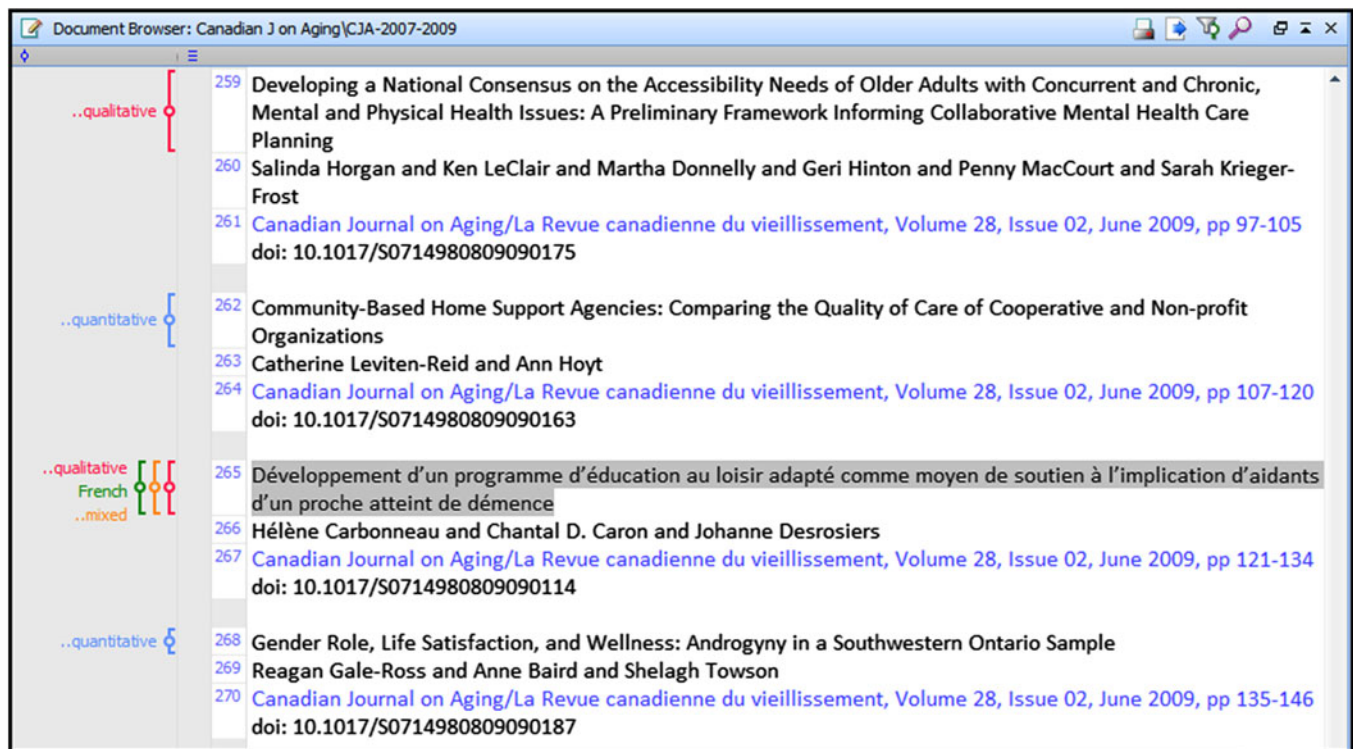
Figure 1: Coding examples

window and the Code Matrix Browser were used to review coding.