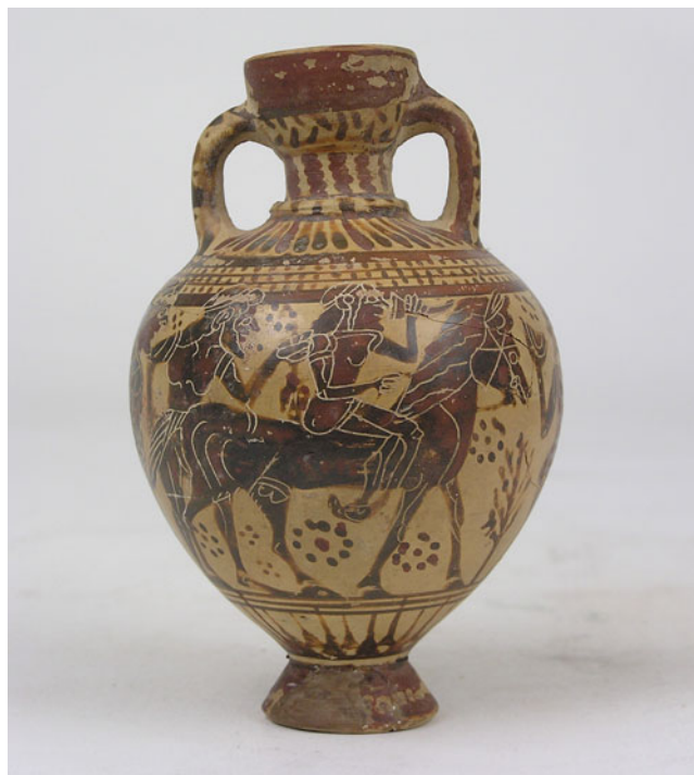
Fig. 7. Black-figure amphoriskos ; Greek, Corinthian, c.590–570. Athens, National Museum: 664.

The second example, an earlier vase dating to the very beginning of the sixth century, is a Corinthian krater in the British Museum (Cat. 13). Some scholars have considered Hephaistos to be disabled on this vase (Seeberg 1965, 103). However, on close examination, his feet do not appear to be deformed. This observation has already been made by Carpenter (1986, 17). There is a strong tradition of clubfoot komasts on Corinthian vases that in many ways has impacted the scholarship on the Return because of the shared lameness (Smith 2009, 70; Ziskowski 2012, 211). This can be seen in the use of the term ‘clubfoot’ when describing the disability, as well as the comparisons that are drawn between lame komast dancers and Hephaistos (Smith 2009, 75).