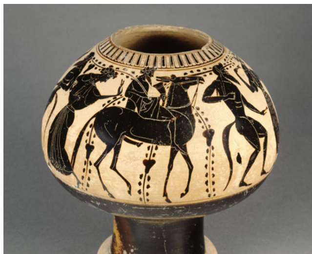
Fig. 2. Black-figure psykter; Greek, Attic, related to Antimenes Painter. Paris, Musée du Louvre: F321.

On one side Hephaistos's foot is clearly rendered in a manner similar to the Paris and Munich vases (Cat. 9 and 10). Instead of the smooth lines that characterise the bottoms of the satyr's feet, with the space between the heel and toe free of any disfiguration, the rider's foot has clear and apparently intended curves that create a scalloped effect on the bottom of his foot. The incision appears as tight and controlled as it does on the rest of the vase, with the details of the