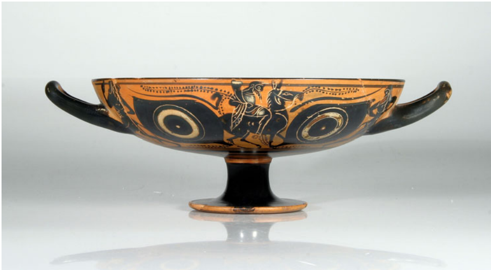
Fig. 4. Black-figure Type A cup; Greek, Attic, attributed to the Painter of the Essen Group, c.530–520. Göteborg, Rohsska Museum: 70.58.