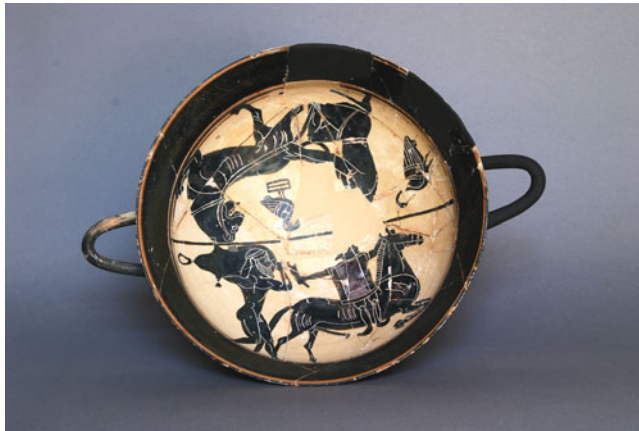
Fig. 8. Black-figure kylix; Greek, Laconian, c.570. Rhodes, Archaeological Museum: 10.711.