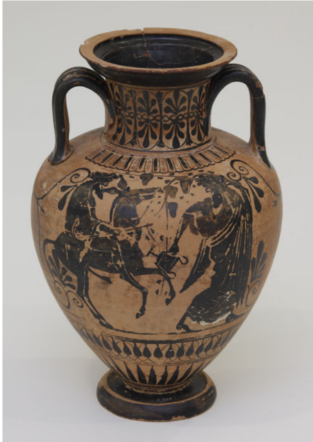
Fig. 6. Black-figure neck amphora; Greek, Attic, Manner of Kleophrades Painter, c.510–500. Frankfurt, Museum für Vor- und Frühgeschichte: B286.

foot heavily contorted into a clubfoot. A cloaked man walking behind him is commonly thought to be Dionysos, although others contest this identification (Isler-Kerényi 2007, 24–7). There are several other differences in the iconography of this vase in comparison to its Attic counterparts showing the Return. The mount appears to be more like a horse than the donkey that is always displayed on Attic vases. The thick and flowing mane is very different from the short bristles seen on donkeys. The ears are smaller and more delicate than the large comical ears of a donkey. The bearded processional companions on this vase are not satyrs, but are generally considered to be padded dancers (Seeberg 1965, 105). Interestingly, komast dancers are rarely depicted as ithyphallic, yet this vase is an exception (Smith 2007, 51). 23 While the identification of the scene on this vase as the Return of Hephaistos is contested (Carpenter 1986, 16; Isler-Kerényi 2007, 24–7), the iconography appears very strongly to be that of the Return. 24 If the rider is taken to be Hephaistos, it represents the earliest depiction of both the Return and his disability.