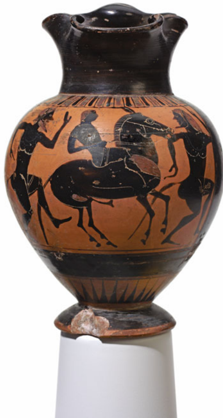
Fig. 5. Black-figure oinochoe; Greek, Attic, Class of London B 534, c.530–520. San Simeon, Hearst Corporation: 9911.