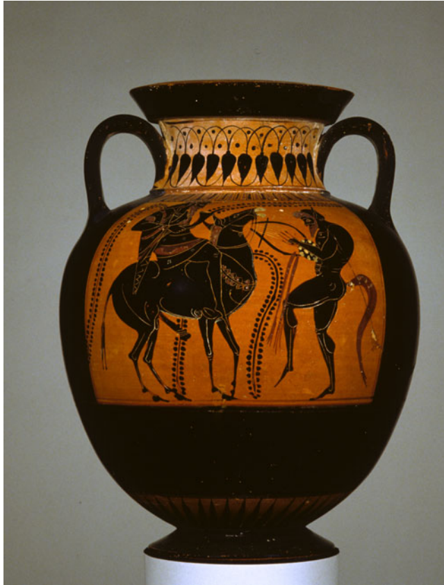
Fig. 3. Black-figure neck amphora; Greek, Attic, attributed to the Euphiletos Painter [Beazley], c. 520 BCE. Ceramic, H. 12 5/8 in. Tampa Museum of Art, Joseph Veach Noble Collection 1986.027.

musculature skilfully done on both the satyr and the donkey, which would indicate that the appearance of the foot is intentional. 11