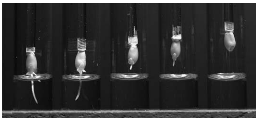
Figure 1. Wheat seeds suspended above water in sealed test tubes. A seed germinates faster (in 3 d) when it is closer to the liquid surface, demonstrating that diffusion of water through air is very dependent on distance. Distances range from c. 1 to 10 mm.

An initial attempt to achieve this (Wuest et al. , 1999) involved a set-up very similar to that of Etherington and Evans (1986). Sealed Petri dishes, filled with soil at different moisture contents, were incubated at a range of temperatures. In some dishes, seed–soil contact was prevented by a piece of coarsely woven fibreglass cloth. This, necessarily,