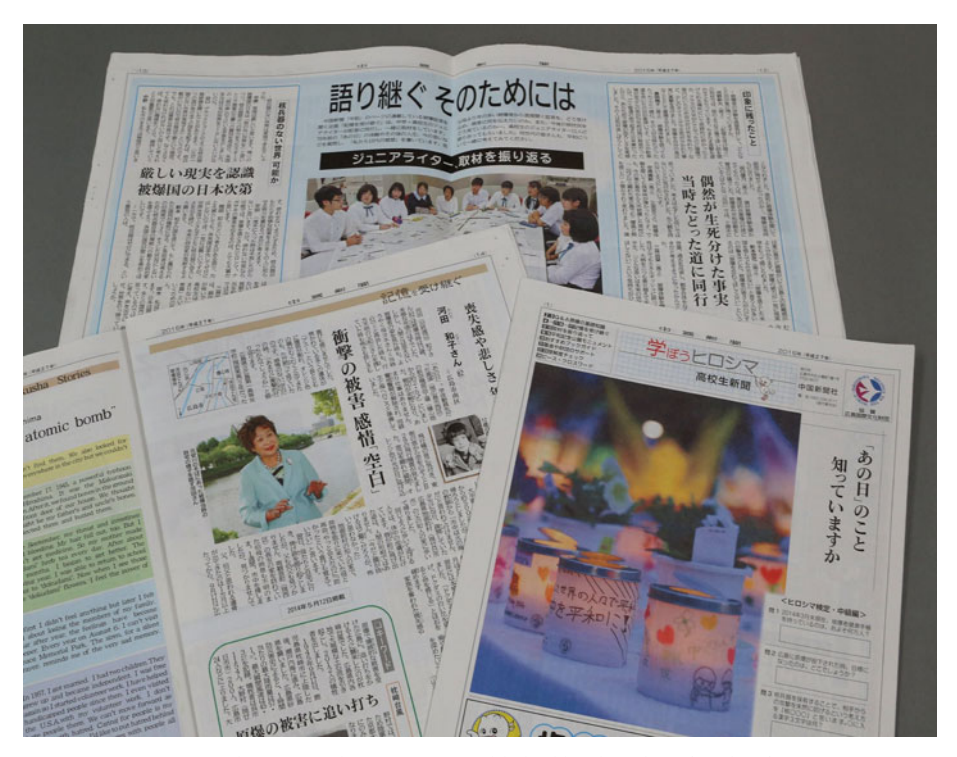
Figure 7. "Let's Learn about Hiroshima", 2015, published by the Chugoku Shimbun in cooperation with the Hiroshima International Cultural Foundation.

Through their work, these young reporters are seeking to prevent the memories of the atomic bombing from fading. This distinctive effort has been positively received, and many notable figures have granted interviews to the junior writers, including United Nations (UN) Secretary-General Ban Ki-moon;<sup>24</sup> Yohei Kono, then speaker of the House of Representatives;<sup>25</sup> and Hayao Miyazaki, the well-known director of Japanese animation.<sup>26</sup>