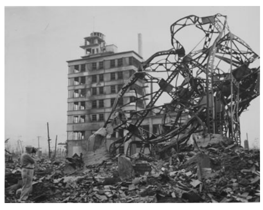
Figure 9. A photograph of the Chugoku Shimbun 's older building in the aftermath of the atomic bomb. The newer building is visible in the background.

Communicating Hiroshima's message of nuclear abolition and world peace to other parts of Japan and other nations of the world is an effort to spread this appeal horizontally, around the world. At the same time, handing down the memories of the atomic bombing to the next generation is an effort to convey the past vertically, across time.