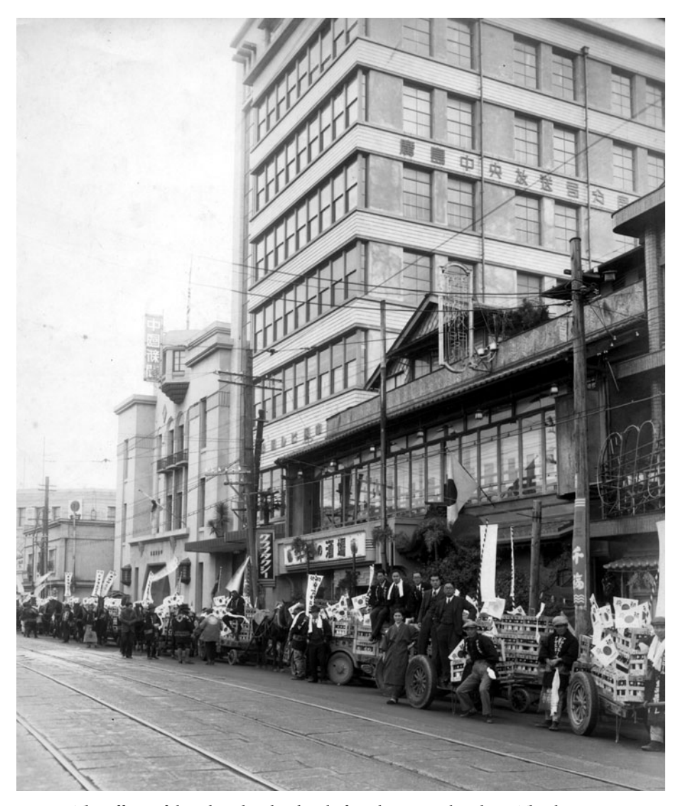
Figure 8. The offices of the Chugoku Shimbun before the atomic bombing. The three-storey main building, constructed with reinforced concrete, is on the left. To its right is the company's newer building, seven storeys tall.

Prefecture have received a copy of this newspaper each year since 2013. The newspaper features the accounts of atomic bomb survivors and basic information on the harm caused by the atomic bombing.