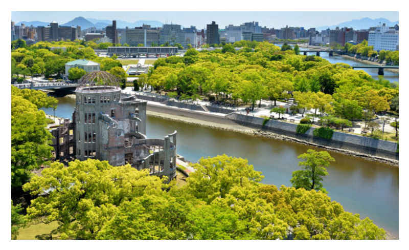
Figure 10. The Hiroshima Peace Memorial Park in spring. On the left is the Atomic Bomb Dome; the Hiroshima Peace Memorial Museum is visible in the background. The white building in the upper right corner is the Chugoku Shimbun 's headquarters.

hibakusha too, even if they or their parents or grandparents did not actually experience the atomic bombing.