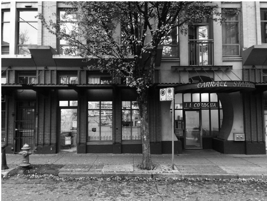
Figure 1 The lighted interior of the Omnicare Pharmacy at Carrall Station appears on the left, the circular entranceway to the residential apartments on the right.

The residential and commercial units in Carrall Station exist as separate parcels of land within the strata property development. This subdivision of buildings into separate parcels with distinct titles has been relatively straightforward in British Columbia since 1966, when the province introduced Canada's first statutory condominium regime. 32 With the deposit of a strata plan in the land title office, an owner-developer can subdivide land into separately titled strata lots. 33