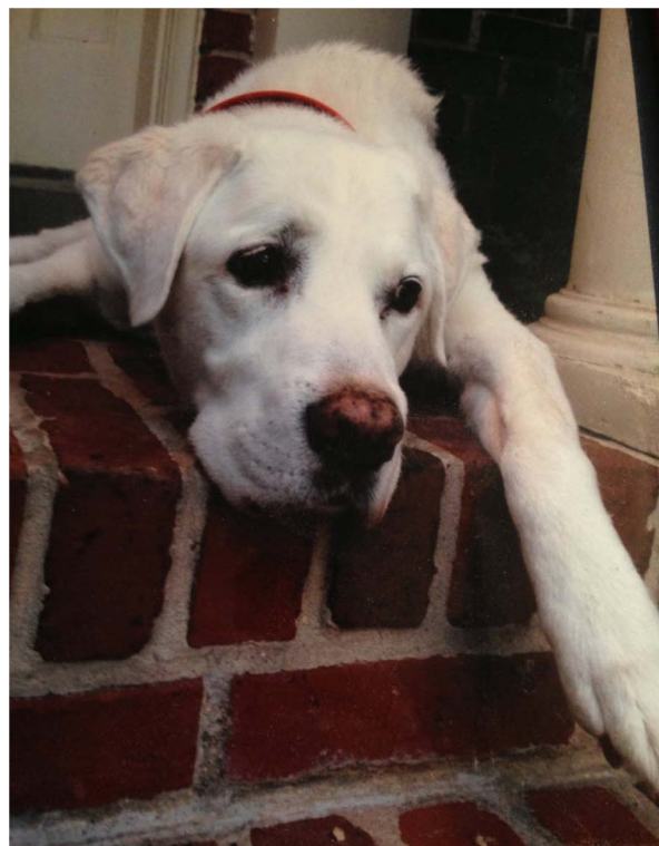
Figure 18. Boola, Duke and Claudia's dog of 14 years (2013).