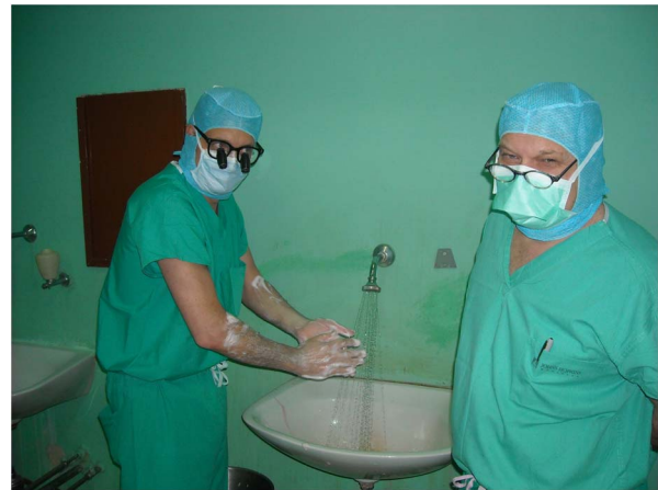
Figure 13. Scrubbing for a case at the William Soler Hospital for Children in Havana, Cuba, 2009.