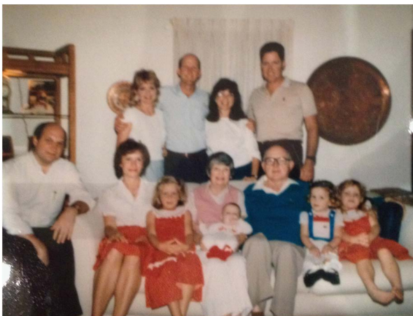
Figure 11. The Cameron Clan in 1985.