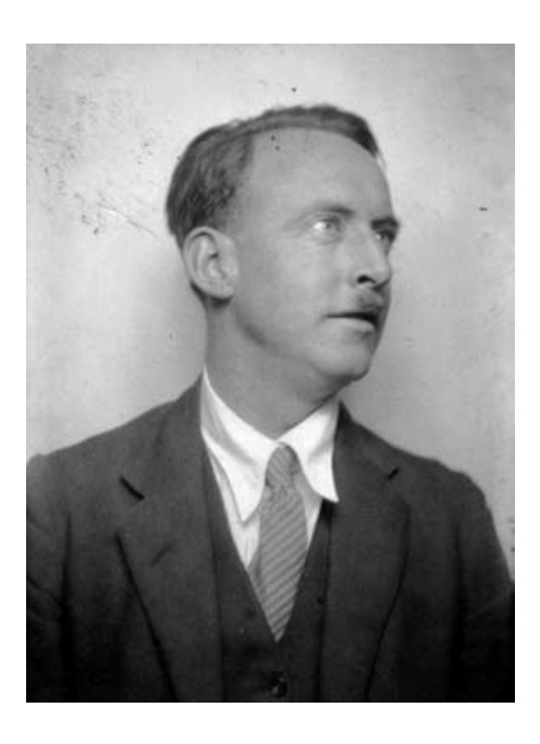
Figure 3 'Soulful'.

preserve ev'ry interesting find') and numerous typescripts of plays written for the university's amateur dramatic society. Apart from the promisingly risqué 'The sultan; or a peep into the seraglio', most of these are drawing-room dramas of a kind of Wodehousian aspect. In sum, the picture is of an interesting, significant, unconventional mind, deeply involved in thinking through the problems of the discipline.