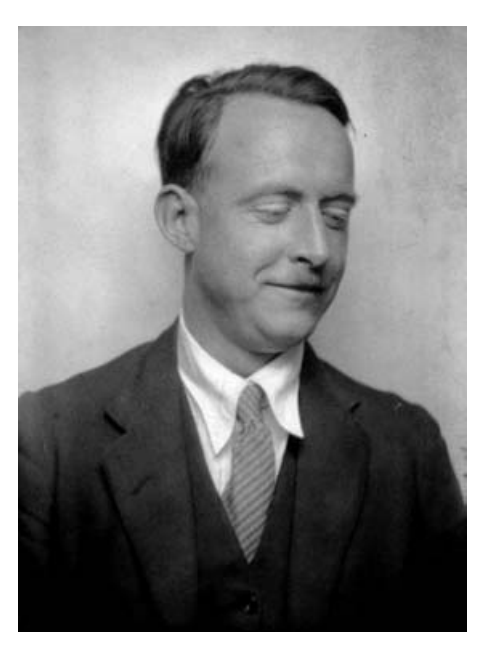
Figure 5 'The modest violet'.

people which remains unmodified by subsequent events, an unlikely sort of project. The alternative would be to frame things differently – to conjecture that Goodwin may have felt slighted, but that he had no right to feel slighted (and that we have no right to remember him as the wronged party).