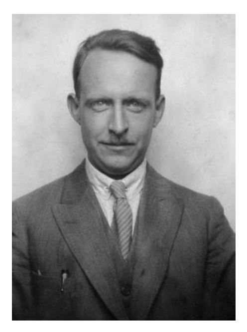
Figure 1 A.J.H. (John) Goodwin (1900–59). The sober-minded academic.

A.J.H. (John) Goodwin (1900–59) is a major figure in South African and African prehistory, responsible for founding the discipline on a professional basis in South Africa, and for setting in place a basic conceptual framework and standards of practice. In the 1920s he established a local chronology and typology of the African Stone Ages which remains in general usage. He wrote the first extended treatment of the history of prehistoric studies in southern Africa (Goodwin 1935), and the first textbook of archaeology for local practitioners (Goodwin 1945). In the mid-1940s he played a key role in the establishment of the Archaeological Society of Southern Africa, and was the founder editor of the Southern African archaeological bulletin, the