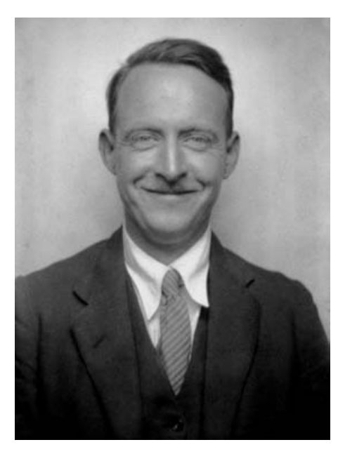
Figure 4 An interesting, significant, unconventional mind.

'Afrikaans/Afrikaner prehistory' which precedes Van Hoepen. South African prehistoric studies have a long history which predates the events under discussion. Some 130 papers on broadly archaeological topics were published in the period 1870 to 1923, covering the territories of what are today South Africa, Zimbabwe, Botswana, Swaziland and Mozambique (Shepherd 2002b). These appeared locally in the Cape monthly magazine, and after 1878 in the Transactions of the South African Philosophical Society (later the Royal Society of South Africa), as well as in the various metropolitan journals (Proceedings of the Society of Antiquaries; Proceedings of the Ethnological Society of London; Journal of the Anthropological Institute). Their authors were settlers and explorers, military men (like Bowker), a Superintendent of Education (Sir Langham Dale, who published under the pseudonym \Delta ), geologists (Thornton, J.P. Johnson, W.H. Penning), a medical practitioner (Kannemeyer) and self-professed collectors and 'antiquarians' (like Rickard). I have seen little to suggest a nascent Afrikaner prehistory in this period (in the sense of a prehistory by and for Afrikaners); on the contrary, I have been struck by the anglophone nature of the project. Nevertheless, perhaps something can be unearthed?