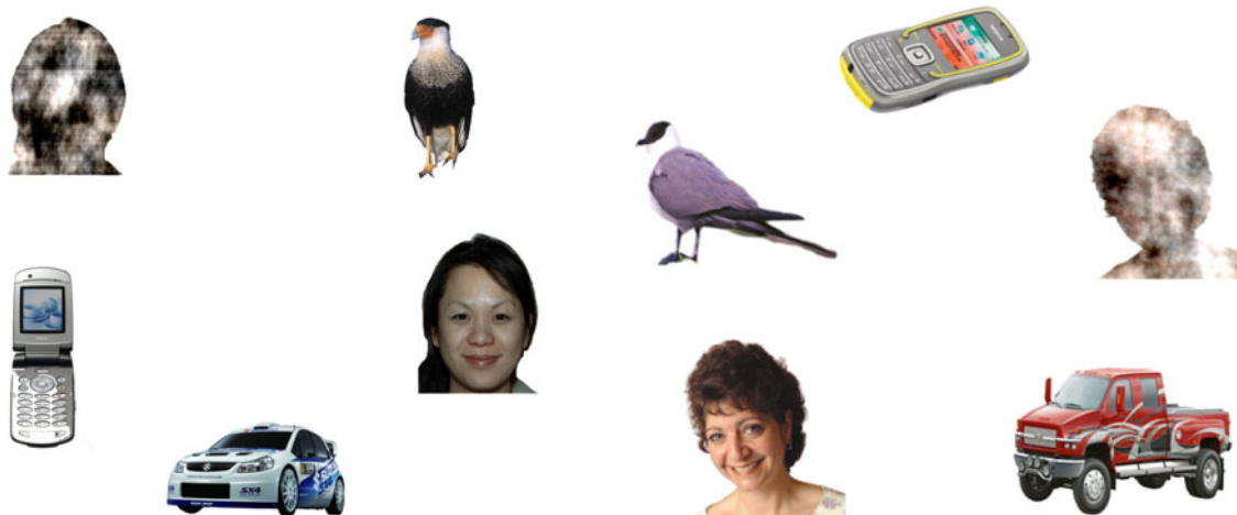
Figure 1. Example of face pop-out stimuli.

Note. Two examples of face pop-out slides originally designed by Gliga et al. (2009). Each slide contained five areas of interest defined in MATLAB: face, noisy face, car, phone, and bird. The noisy face areas were created by randomising the phase spectra of the face on the slide while maintaining the outer face contour.